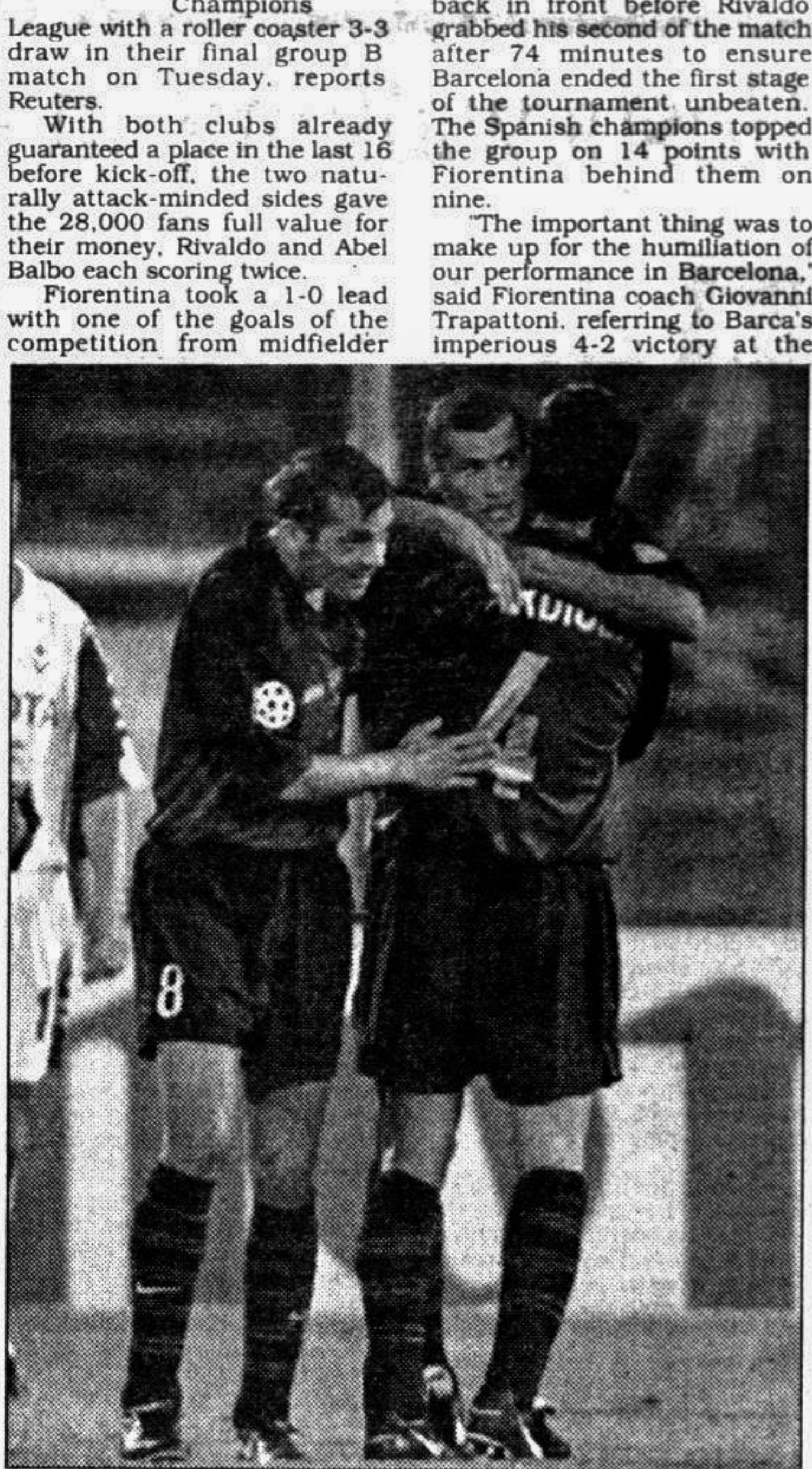
Barcelona's Brazilian superstar Rivaldo (C) being congratulated by teammates after one of his two goals against Fiorentina in the Champions' League on Tuesday.