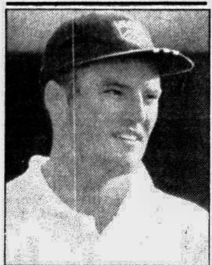
Stuart MacGill (Australian leg-spinner)

"I think I'm progressing really, really well and I'm aiming very strongly to play in the Australian series against India."