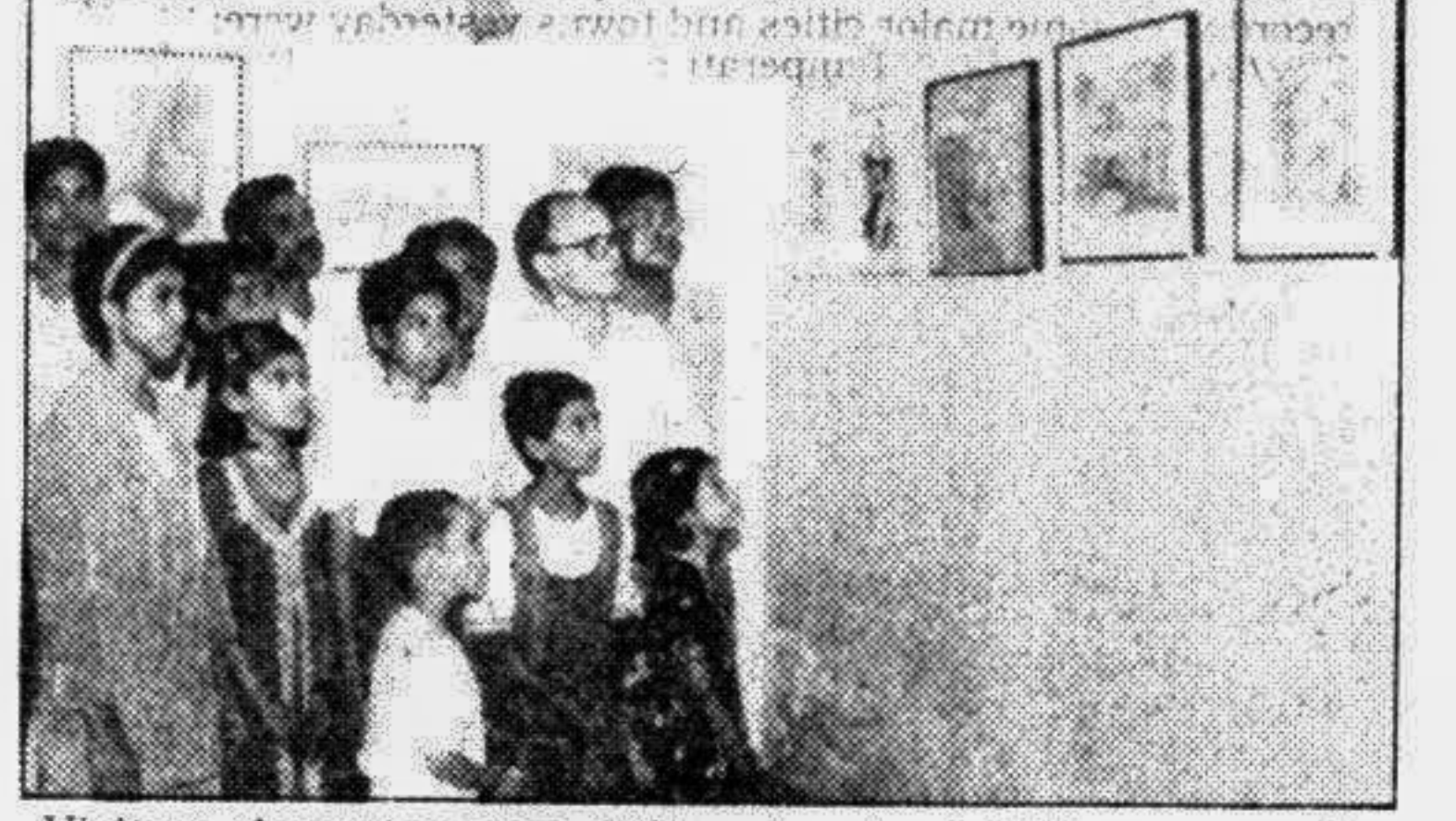
Visitors thronging at a children's art exhibition arranged in Sylhet recently on the occasion of Child Rights Day.