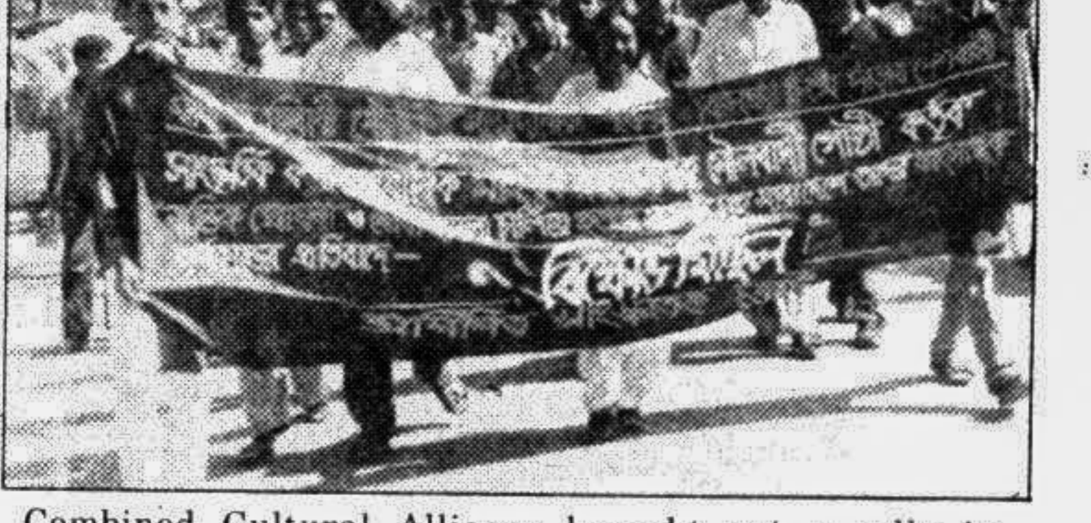
Combined Cultural Alliance brought out a rally in Rangpur town recently protesting attack on The Daily Sangbad correspondent of Rangpur.