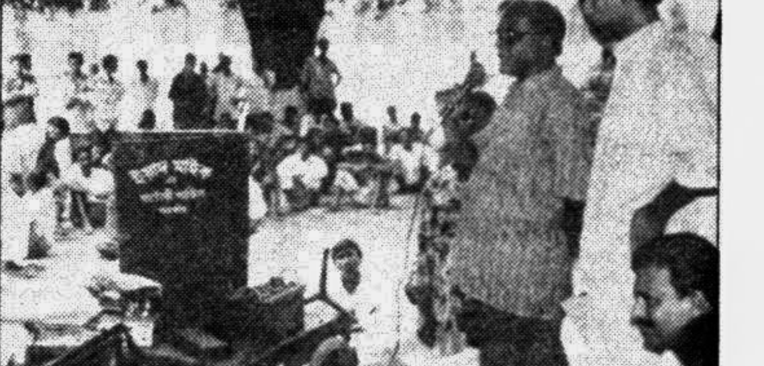
Bangladesh Workers Party laid seize to Satkhira DC and SP offices recently in protest against leasing out of Canadia canal in Tala thana. Local peasants used the canal for irrigation purpose. They have launched a movement for cancellation of the lease.