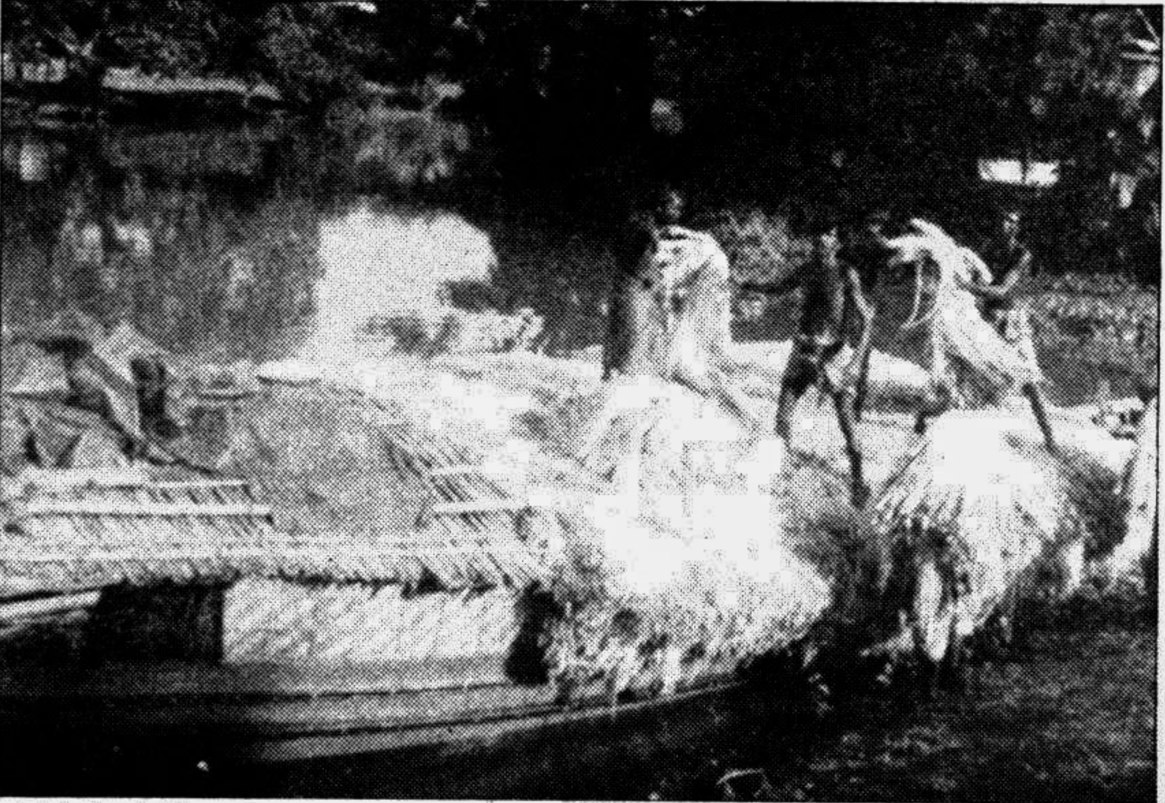
A jute loaded boat is seen at Pakulla ghat in Tangail. A farmer has brought it from far flung area. But jute is being sold at Taka 260 per maund in the local bazaars, while the farmer produced one maund of jute at the cost of Taka 300. Observing the poor price the farmer has become completely frustrated.

ASP Devdas Bhattacharya said two of the bombs might be of high intensity.