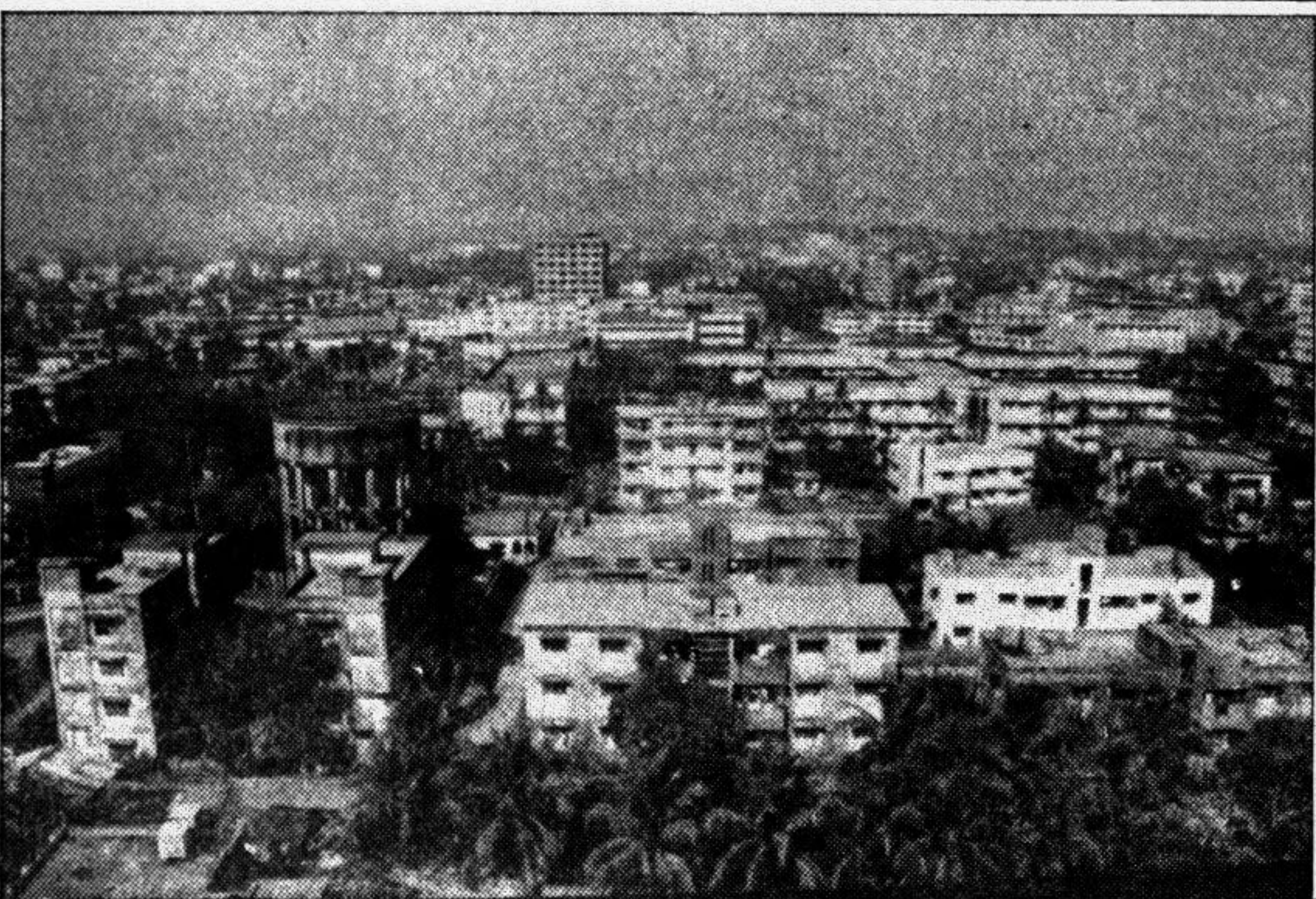
The city dwellers of Chittagong have to suffer a lot due to unplanned growth of Agrabad area. In many places of the area vehicles of the Fire Brigade or ambulances of various hospitals and clinics cannot reach the destinations in case of fire incidents or for the purpose of emergency medicare service.

According to the District Agriculture Extension Department (AED) sources, 225 field workers have already been engaged across the district to supervise and make the programme a success.