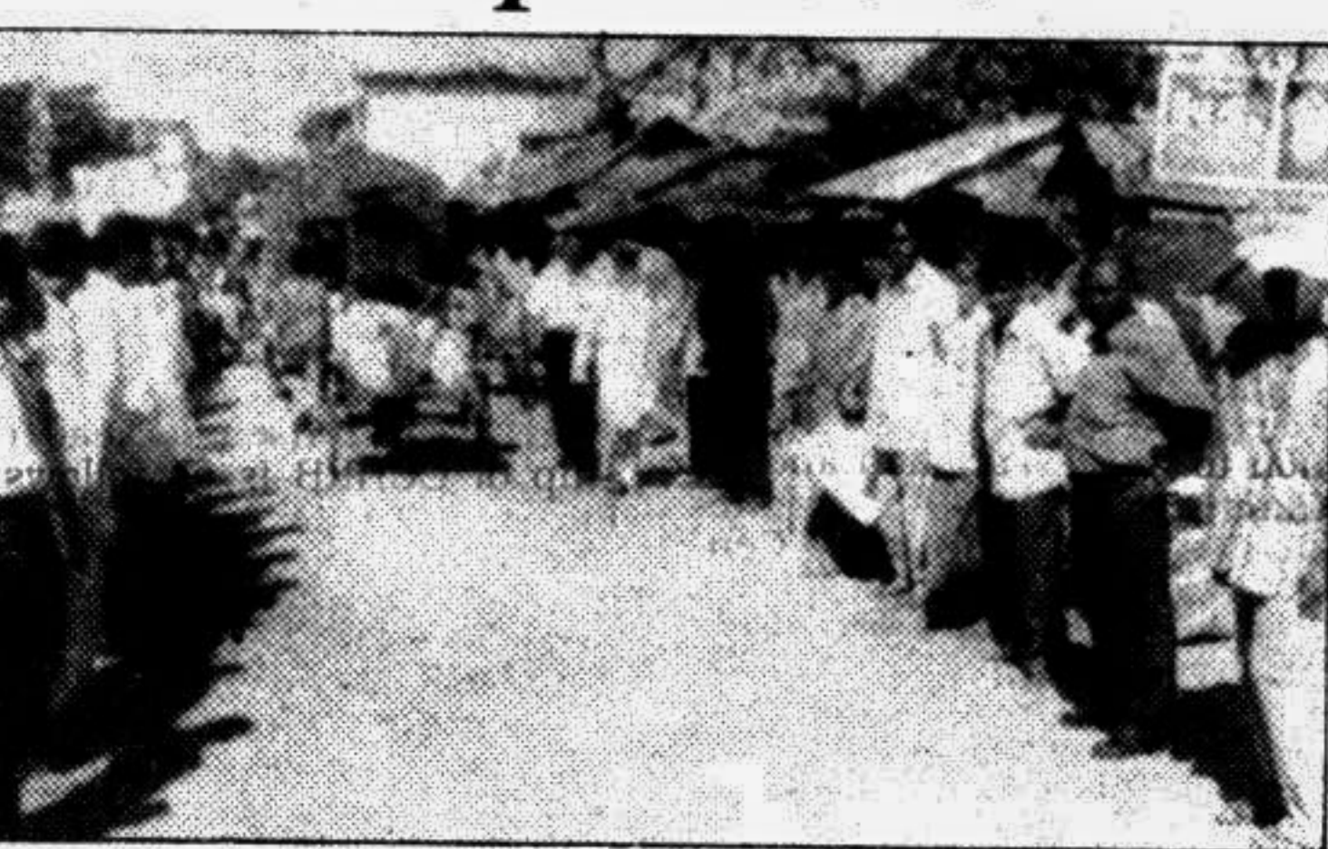
Communist Party of Bangladesh organised a human chain at Kadamtoli in Gaibandha town demanding immediate renovation of the local Bridge Road.