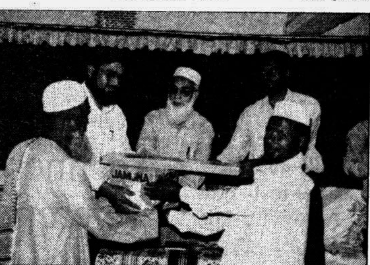
The Deputy Director Of Islamic Foundation, Natore distributed electric fans recently among the representatives of various mosques under Taka 60,000 Mosque Development Programme.