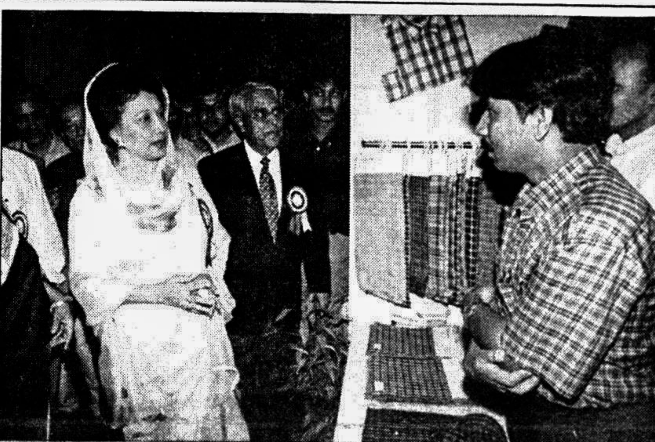
BNP Chairperson and Leader of the Opposition in Parliament Khaleda Zia visiting a stall at BATEXPO '99 in the city yesterday.