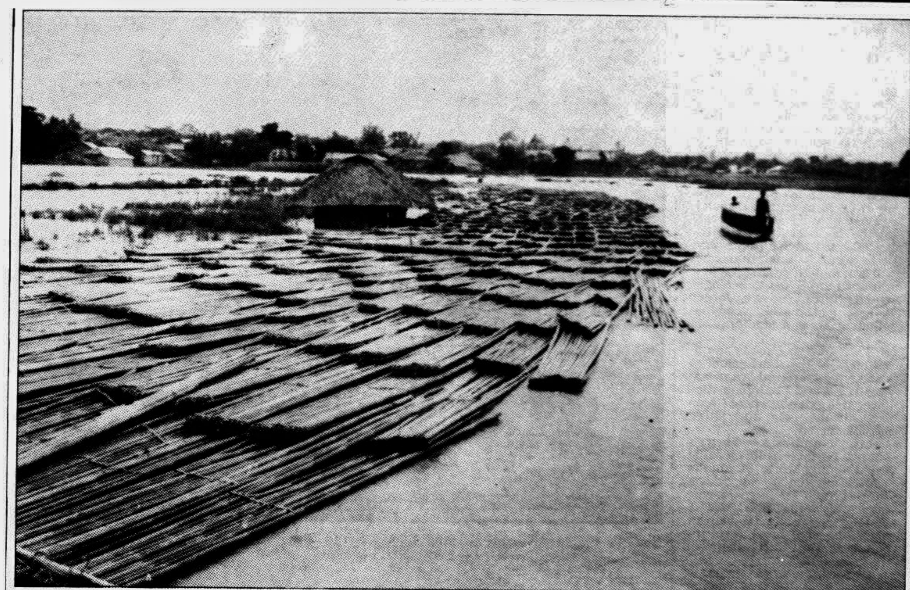
The mobile island: Art of riverine navigation is demonstrated by two or three people, moving an island of bamboos hundreds of miles to a port. There are at least six types of bamboos grown in the country. Some are useful as strong pillars, some fences and various other purposes. The picture shows an island of bamboos being navigated through rivers in the Chittagong Hill Tracts which is famous for producing bamboos. On top of the island a small hut is home for the seasoned navigators who mainly depend on the tides to move on to their destinations. The painstaking journey from CHT to Dhaka could take as much as one month to complete.

Arsenic was detected in the tubewell waters on December 12, 1997. Since then, water samples of 1,348 tubewells were examined and of them 278 or 20.62 per cent tubewells detected with arsenic beyond permissible limit of 0.05 mg.