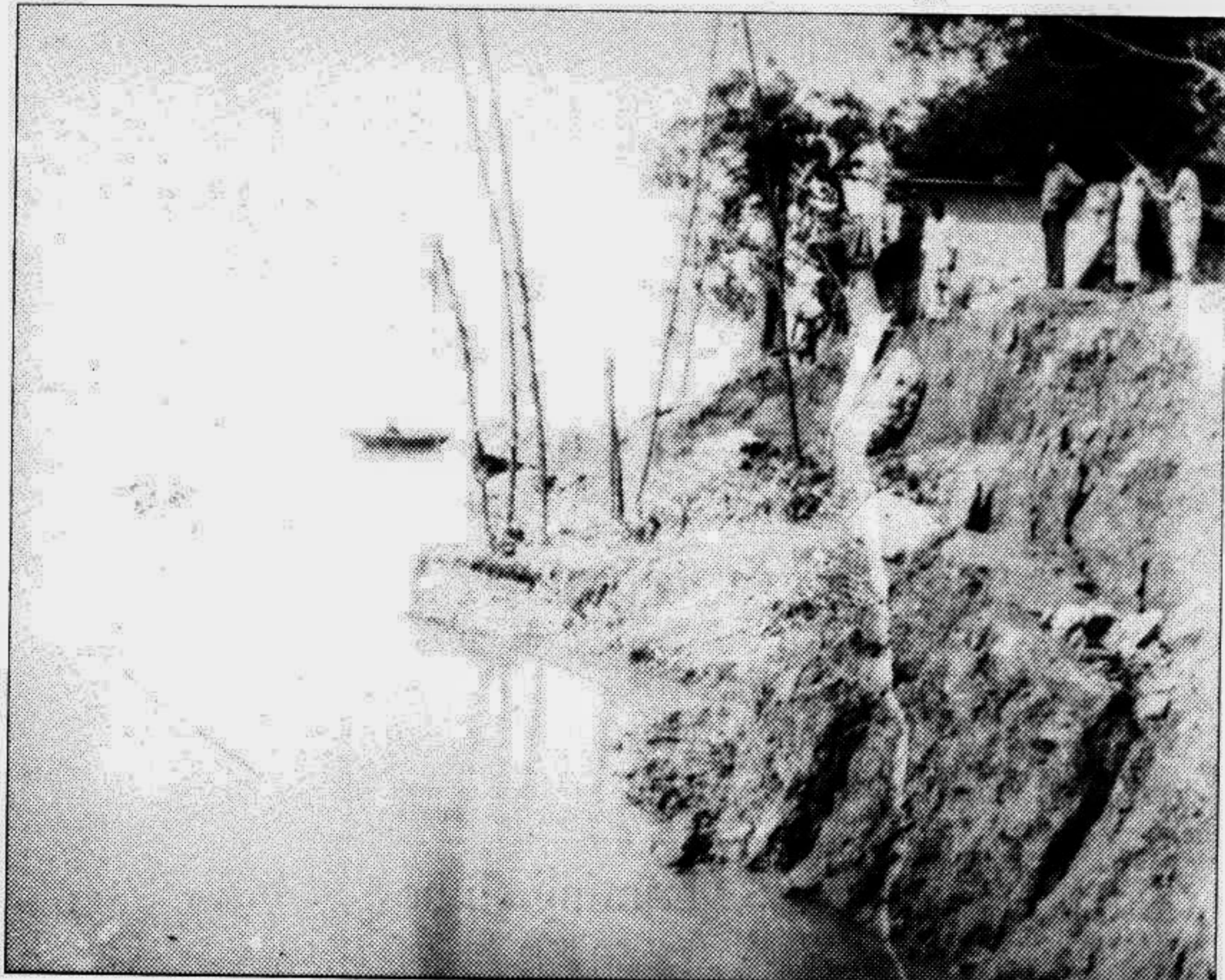
Living beside erosion prone area: Erosion by the River Padma has taken serious turn again. This is because of fall in water level of the river. This photograph was taken recently from Premtoli in Godagari thana of Rajshahi district.

common people and Border Security Force (BSF) of India and Bangladesh Rifles (BDR) have been occurring very frequently. Unless the river erosions are checked, border disputes will aggravate in future, local people have apprehended.