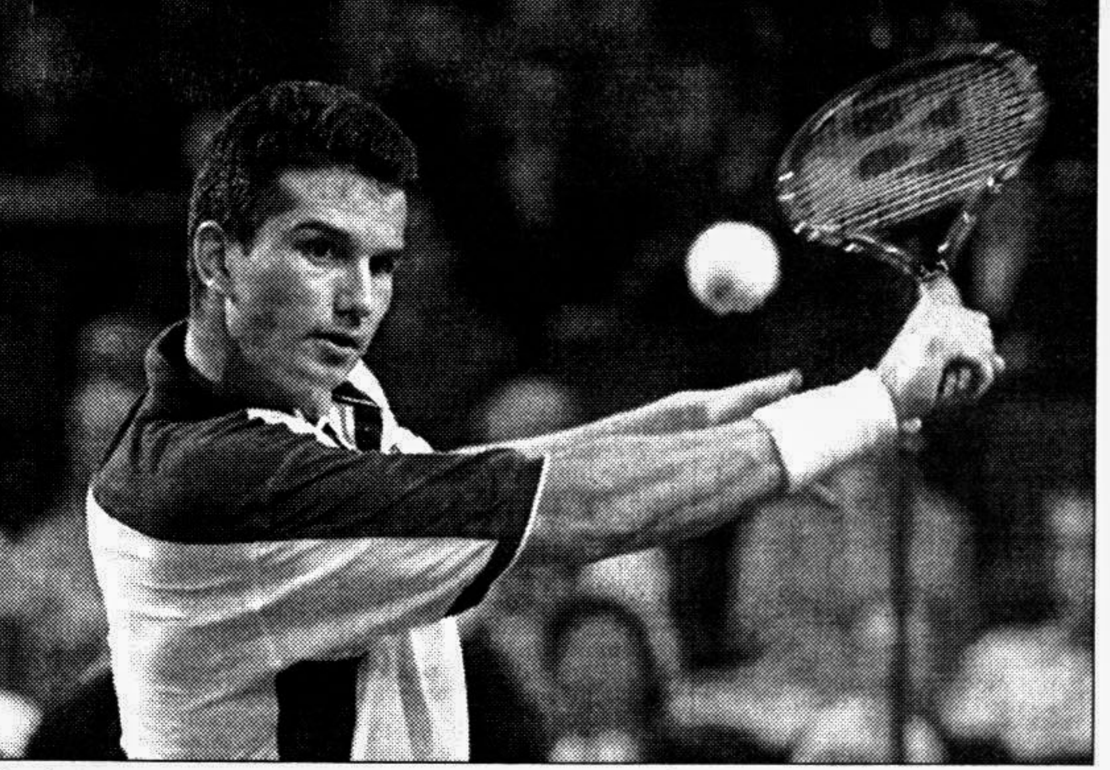
Dutch Richard Krajicek makes a backhand return against Argentine Mariano Zabaleta at the Eurocard Open on October 29.

Their last clash came at the US Open last month, with Rusedski tossing out a two-set lead to lose in the fourth round. Getting even was definitely on Rusedski's mind. "To come through this pressure and finish off a match like this was extremely satisfying." The Briton added that his next match won't get any easier against another huge server like himself and Martin. Sweden's 13th seeded Thomas Enqvist put off Marcelo Rios of Chile 6-4, 6-2 and next plays Agassi. Australian Open finalist Enqvist has had a modest season after his early-year run of success but was playing in his tenth quarterfinal of 1999. Rios came into Stuttgart after winning a title in Singapore and losing a final in Shanghai against Swede Magnus Norman.