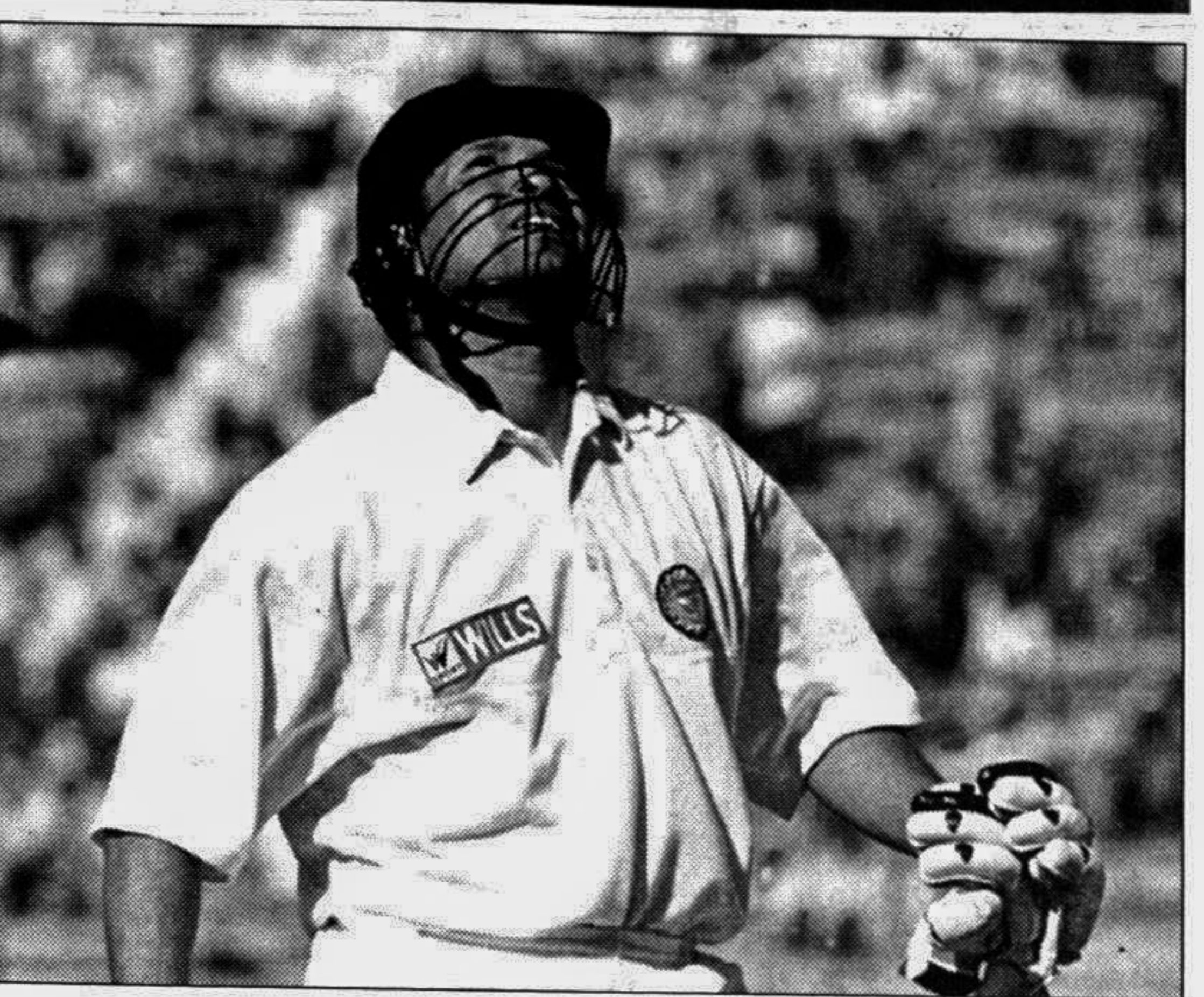
OH! THANK YOU! Indian master batsman Sachin Ramesh Tendulkar looks up to the heavens after completing his maiden double Test hundred at Ahmedabad yesterday.