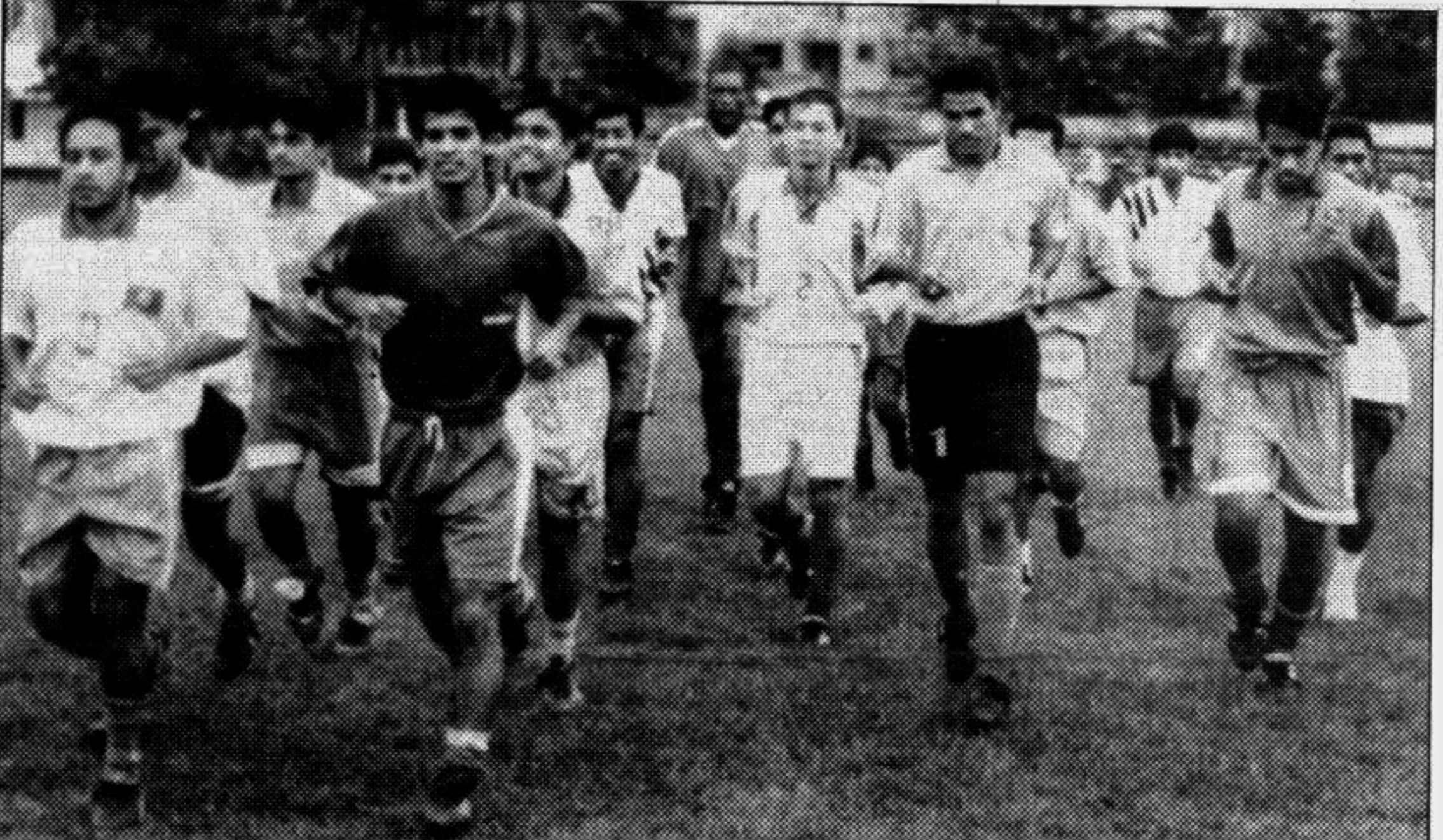
IT'S TIME TO PRACTISE: Abahani footballers jog at their club ground in Dhanmondi yesterday.

Despite the hype in the two camps, both the football teams have lost the magic that could draw plus fifty thousand crowd when they met some years back. Today at Mirpur, anything near half of that would be flattering.