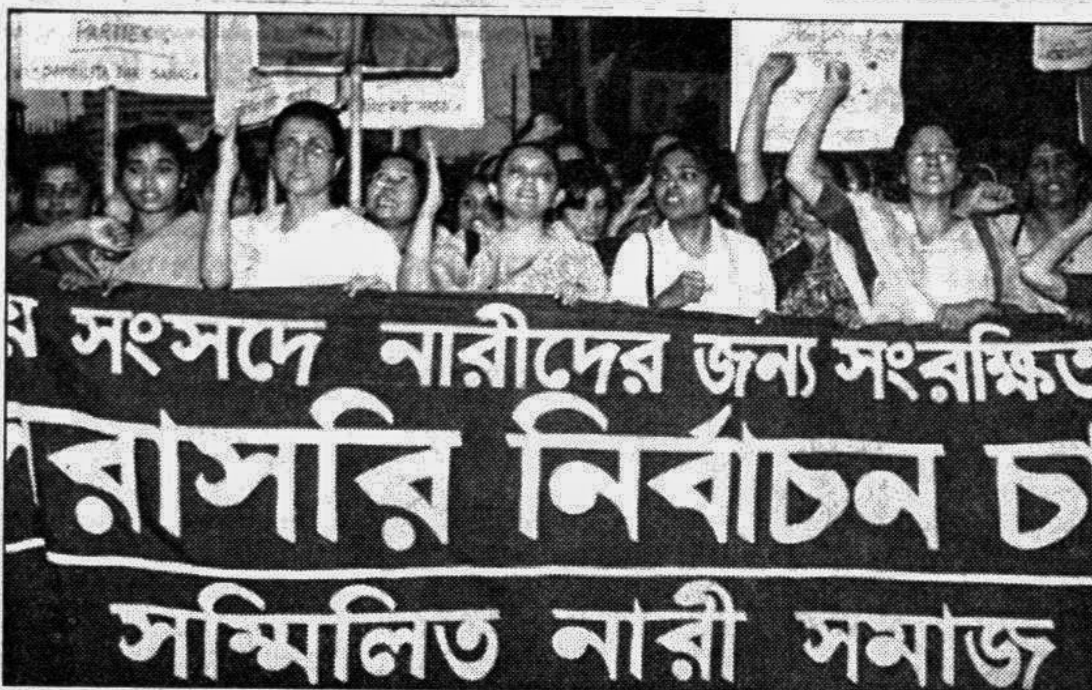
Sammilita Nari Samaj brought out a procession in the city yesterday demanding direct elections to the reserved seats for women in the Jatiya Sangsad.

The reception will be held at the main auditorium of the National Museum at 6.00 pm on November 2.