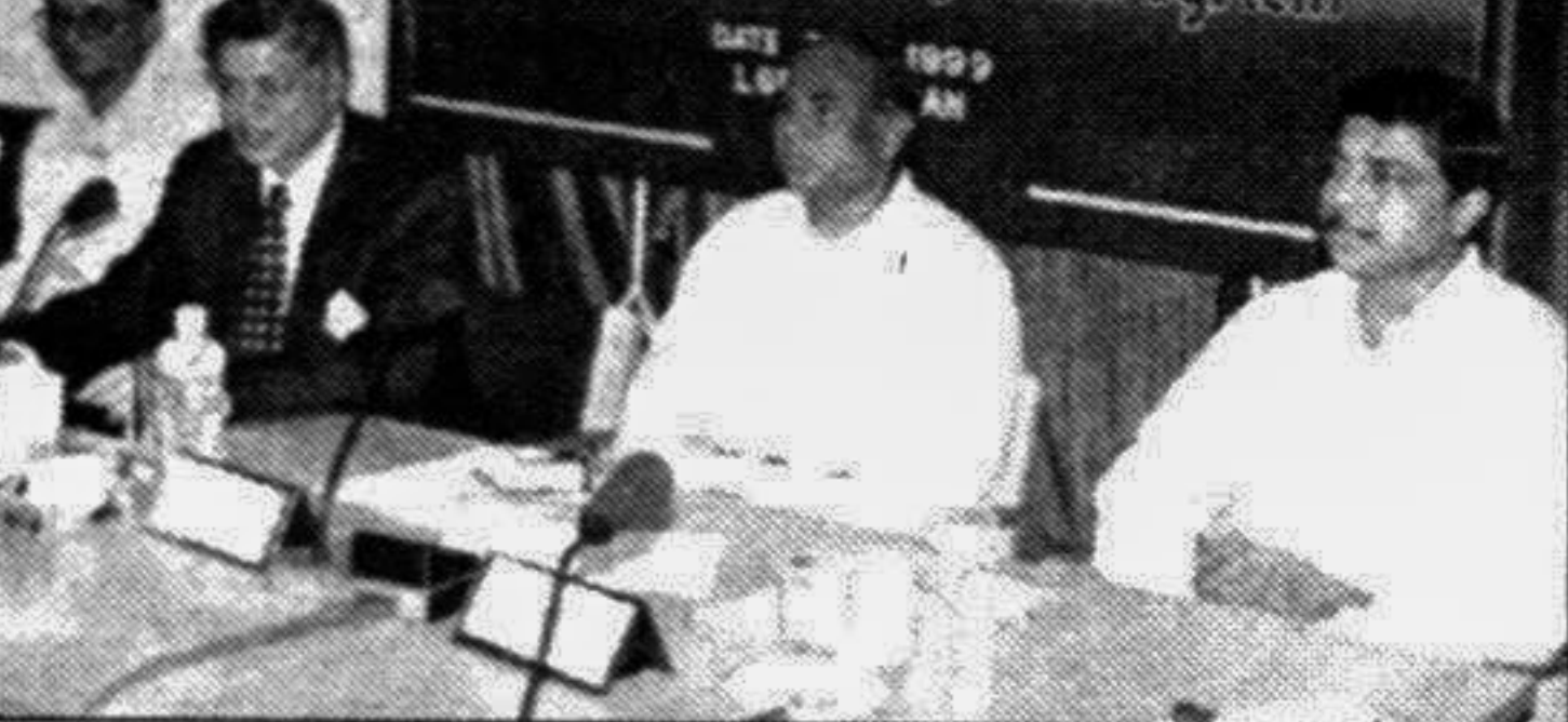
A seminar on 'Integrating Water Management Cooperation Associations with the Cooperative Management System' was held at the LGED headquarters in the city yesterday.