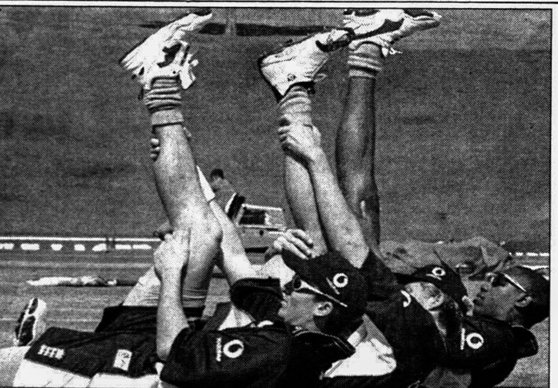
England cricketers, who arrived in South Africa a couple of days back, stretching during a practice session at the Centurion Park stadium in north of Johannesburg yesterday.