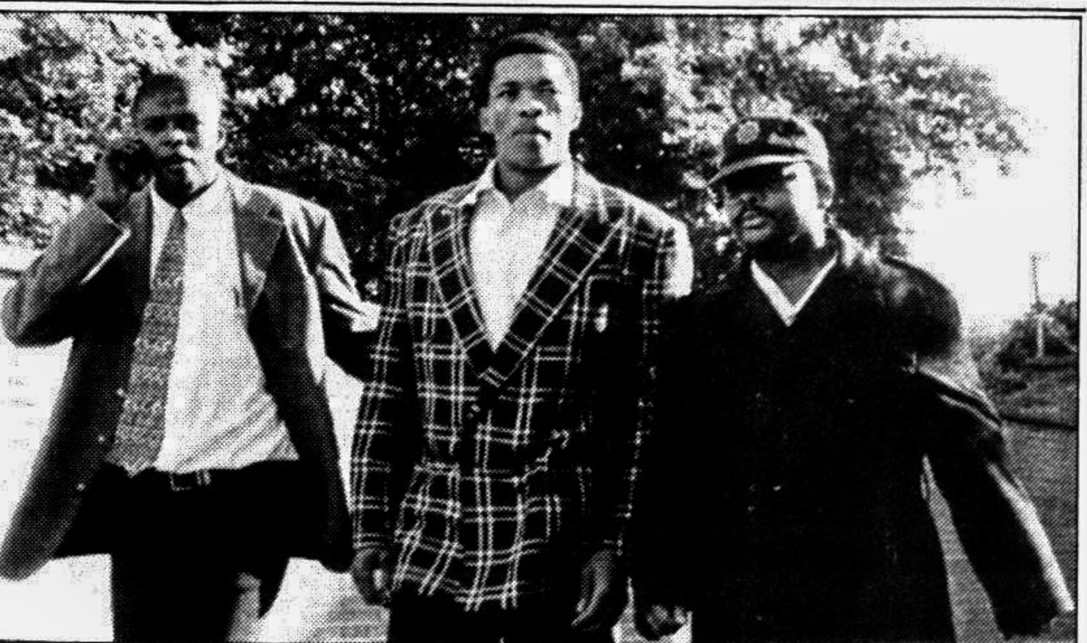
An AFP file photo shows South African cricketer Makhaya Ntini (C), accompanied by a policeman (R) and an unidentified man, leaving the Grahamstown High Court after a hearing on October 20.

NEW ZEALAND: Stephen Fleming (captain), Matthew Horne, Chris Harris, Craig Spearman, Nathan Asle, Gary Stead, Chris Cairns, Adam Parore, Dion Nash, Daniel Vettori and Paul Wiseman.