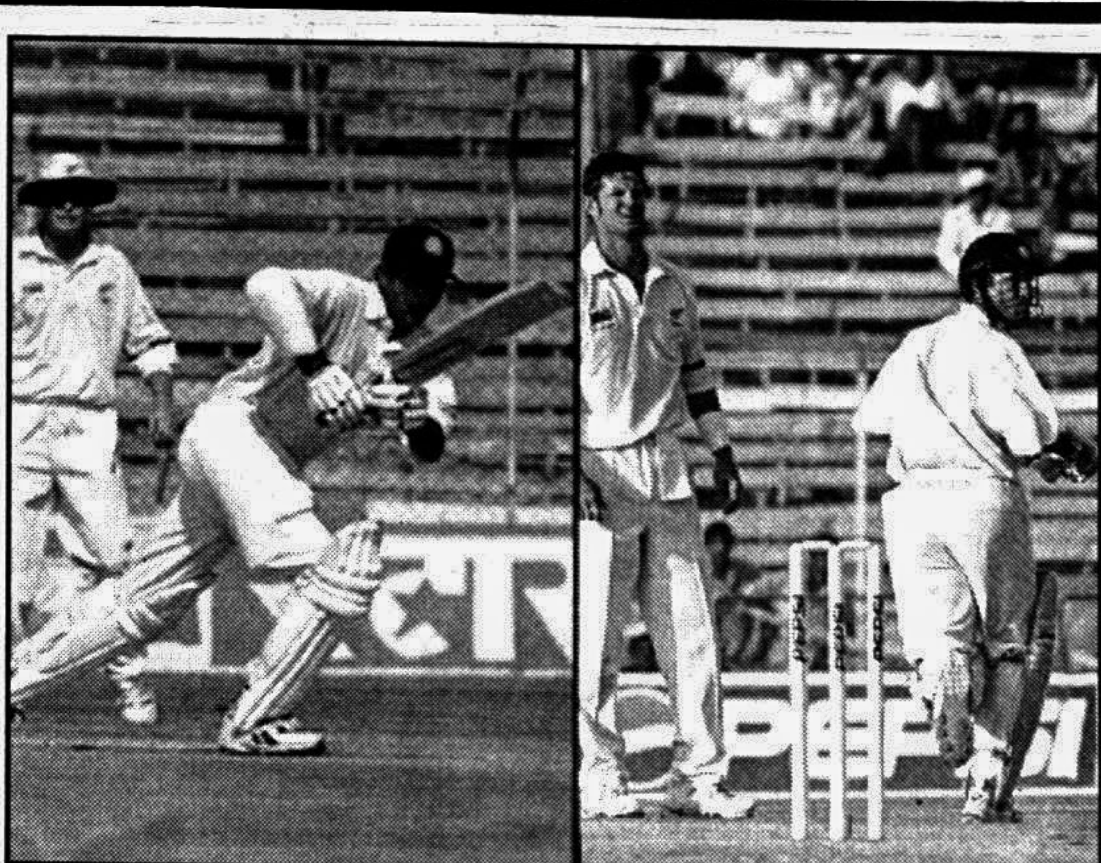
THE CENTURIONS: India opener Sadagopan Ramesh (L) and skipper Sachin Tendulkar are in action during the first day's play of the Ahmedabad Test yesterday.

Akram is set for his first appearance of the tour in the match against Queensland while wicketkeeper-boatsman Moin Khan, who missed the second limited overs game in Perth because of illness, is expected to return.