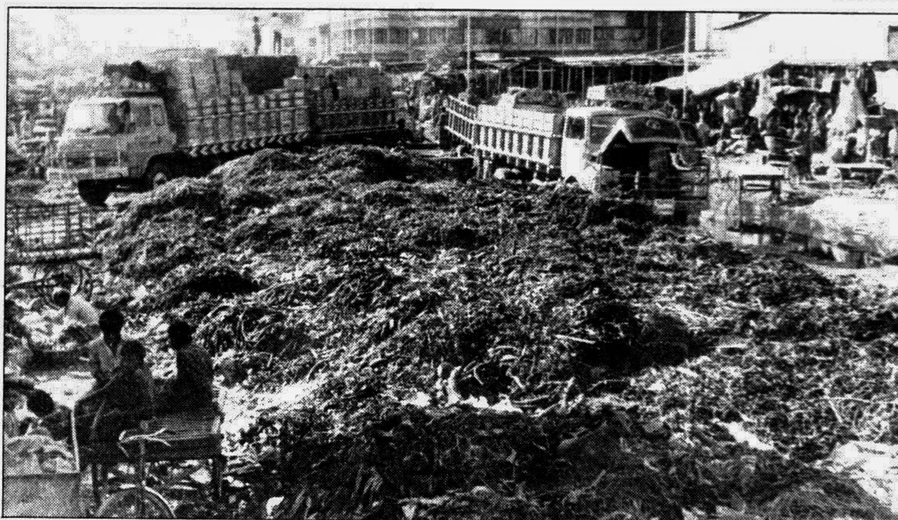
THIS IS KARWAN BAZAR: The veritable mound of garbage that continue to pollute the busy business centre in the heart of the city. Several stories and such photos published in The Daily Star however failed awake the city fathers.

All in all, our city life is fraught with many preventable hazards and pitfalls on the roads. In the midst of such under-ranging dangers, it behoves us to be more cautious and vigilant as far as possible, and to avoid any situations where our own safety may be at stake.