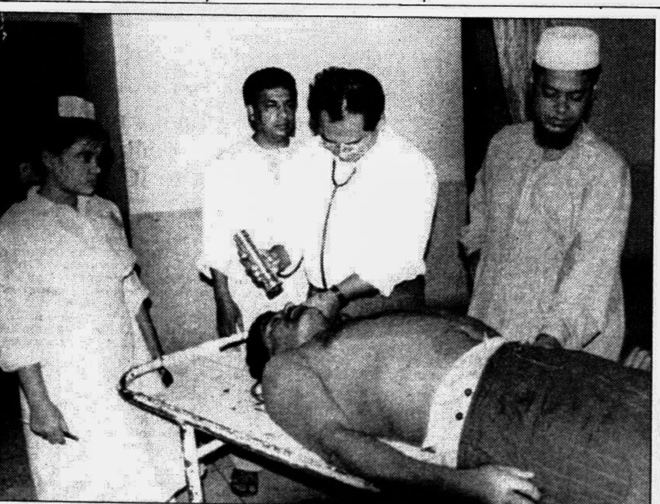
Normalcy returned to DMCH yesterday as doctors resumed their duties.