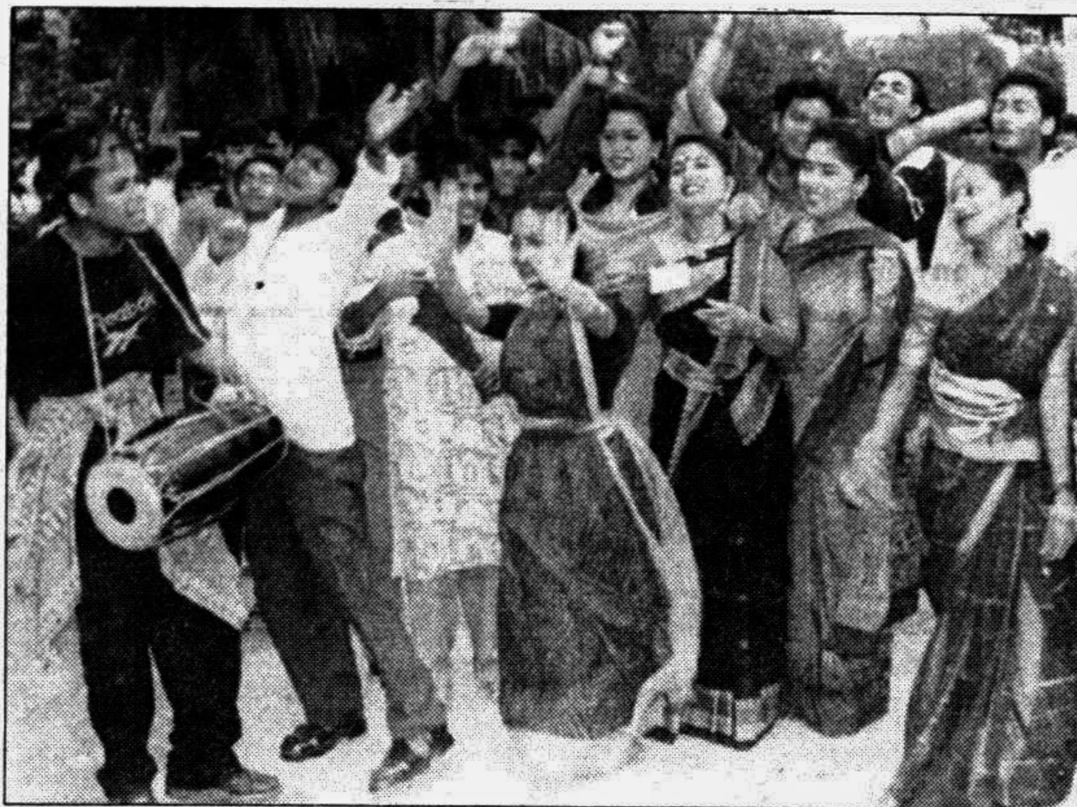
Udichi Shilpi Goshthi brought out a colourful procession in the city yesterday to mark the theatre festival that began yesterday.