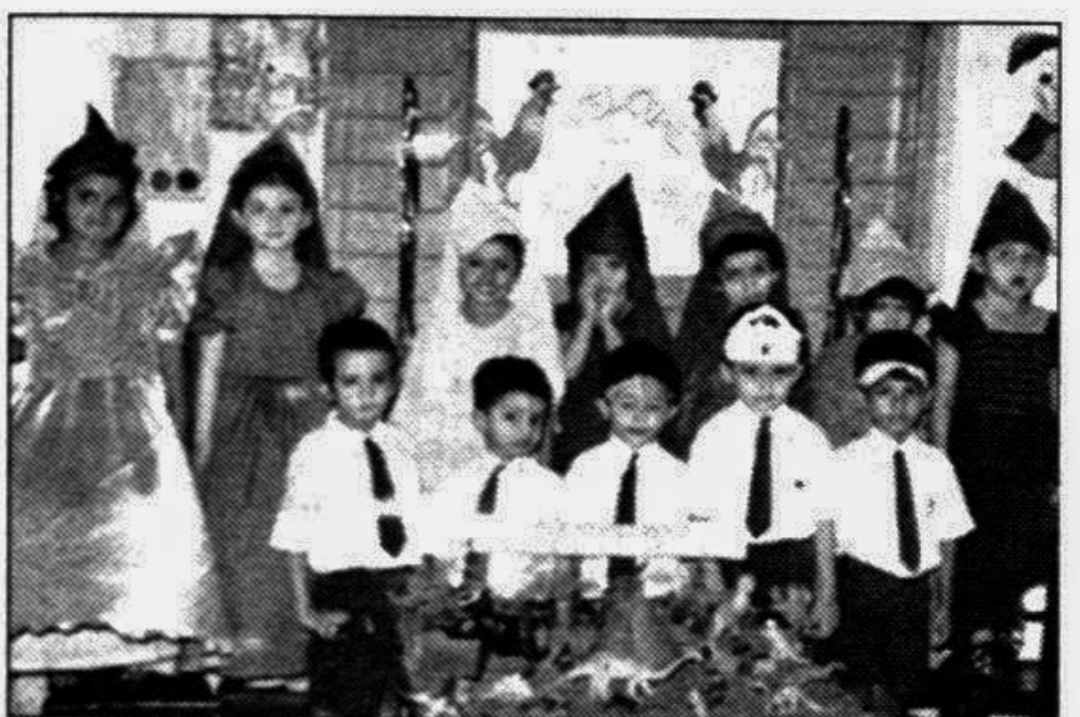
Young participants at the annual science fair of Sunshine School which was held at the school premises at Khilji Road in the city recently.