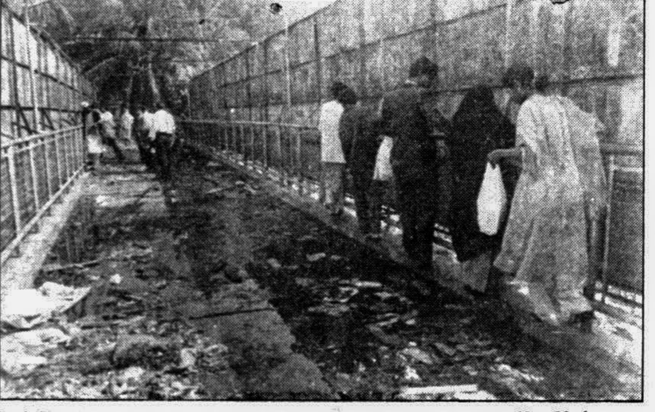
Condition of the footbridge in front of Municipal School near Chittagong New Market.

CHITTAGONG, Oct 27: Three footbridges built here at a huge cost over one and a half decades ago remained almost unused from the very beginning due to odd location.