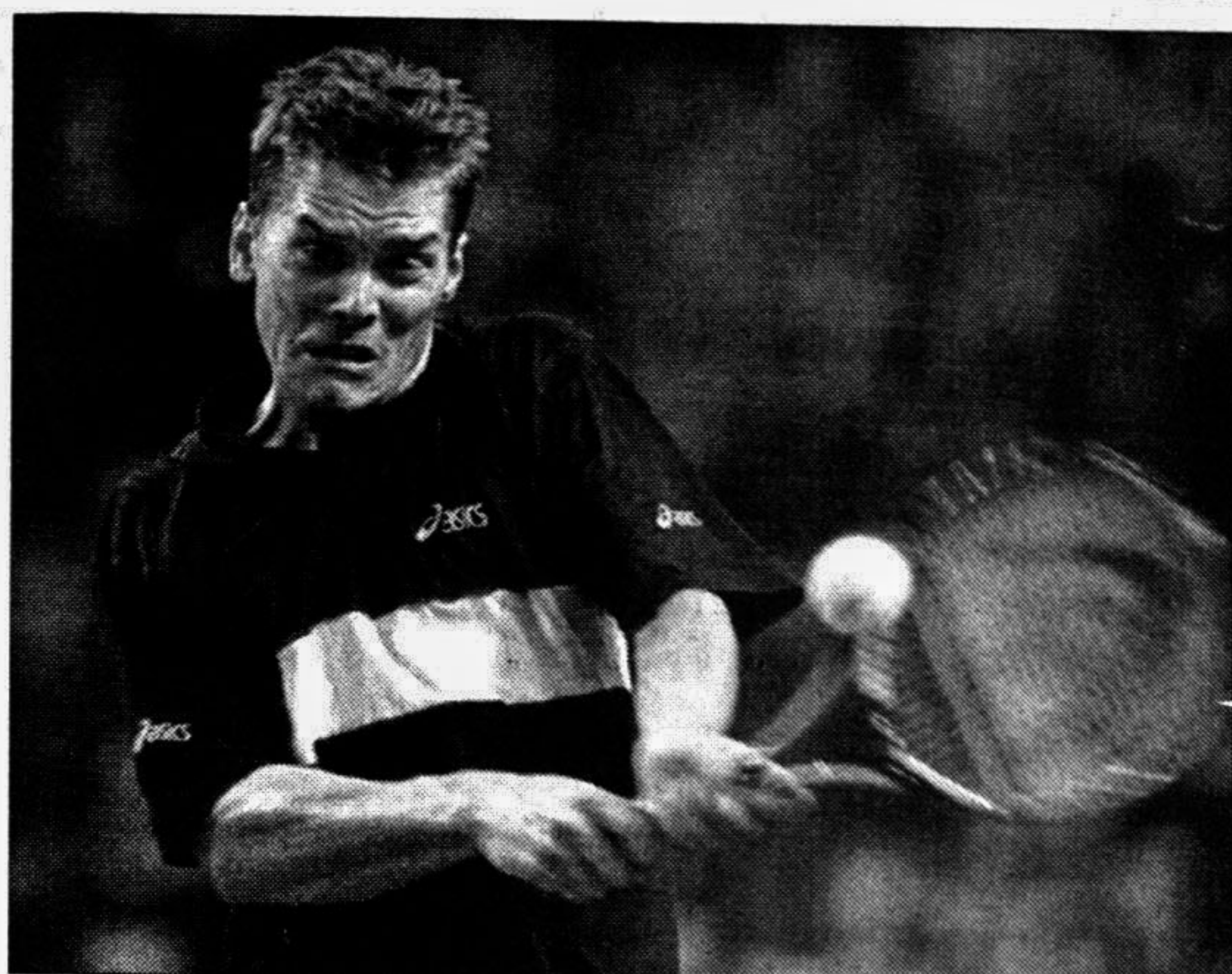
Swede Thomas Enqvist executes a backhand return against American Michael Chang at the Eurocard Open in Stuttgart on Tuesday.

Germany's Anke Huber became the second seed to crash after the tournament's number seven, Russian Elena Likhovtseva, bowed to Austria's French open quarterfinalist Barbara Schwartz in straight sets on Monday.