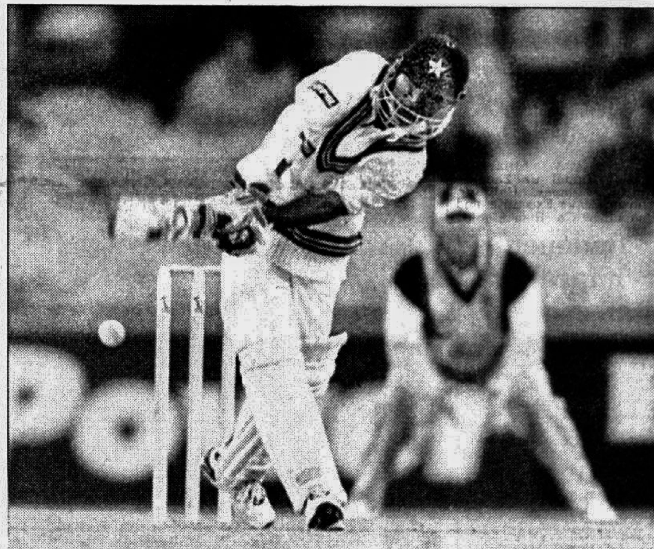
Pakistan opener Saeed Anwar plays one on the on-side during the tour match against Western Australia at the WACA yesterday.