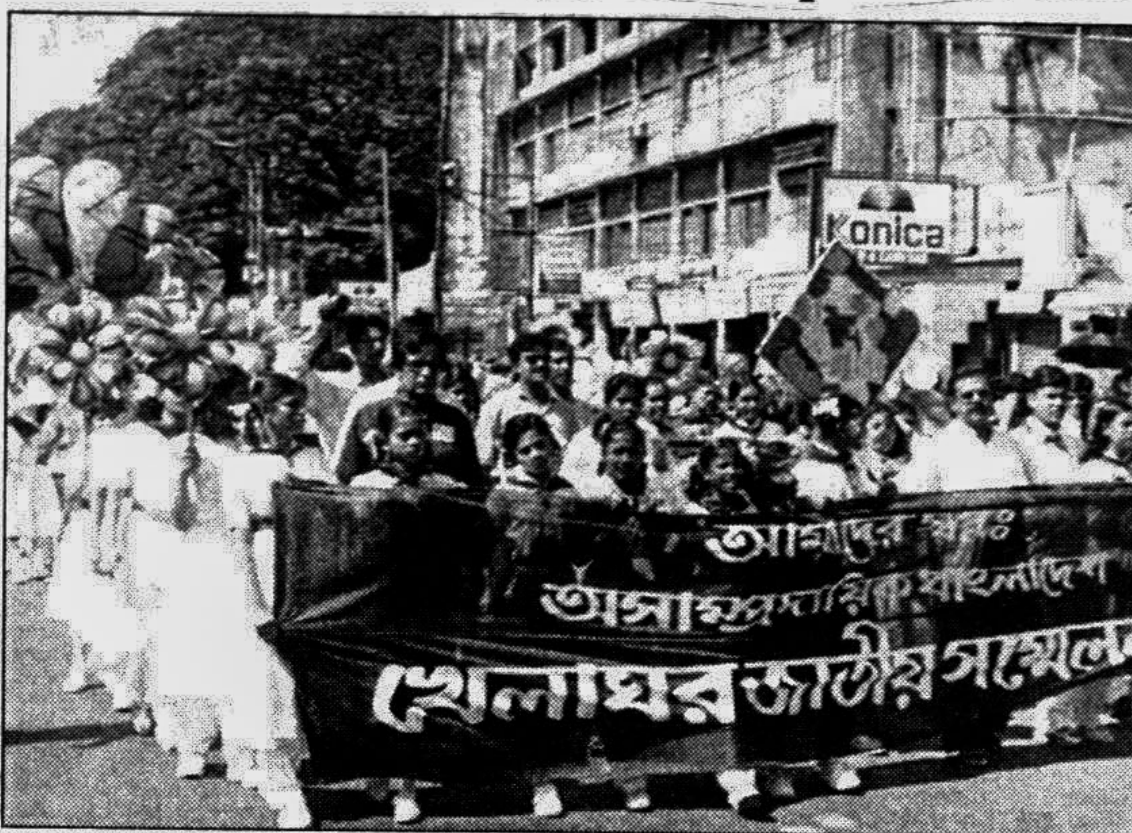
Members of Khelaghar brought out a colourful rally in the city yesterday on occasion of their national conference beginning today.