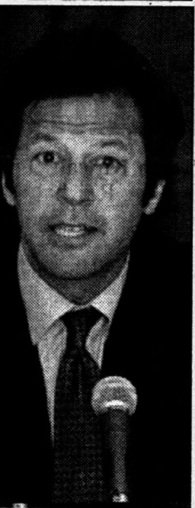
Imran Khan (Pakistan cricket legend) "There should be job security for cricketers."