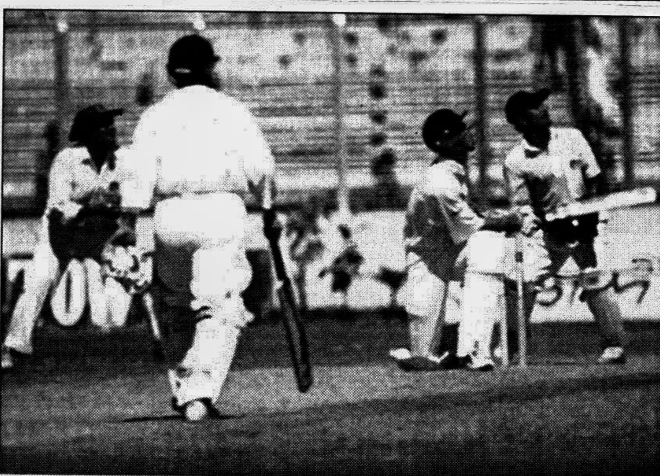
Action from the second day's proceedings of the three-day match between Bangladesh and England A at Chittagong yesterday.

PERTH, Oct 26 (Internet report): Burly batsman Inzamam-ul Haq has a heel injury and is expected to miss the opening two matches of the Pakistan tour. In an inadequate preparation, Inzamam will go into the first Test at the Gabba in Brisbane on November 5 with only a four-day game against Queensland under his belt. He limped through Pakistan's first training session of their five-week tour at the WACA Ground yesterday, not batting or bowling or taking part in fielding drills. "He had a cortisone injection about two days ago and he will be OK in about 48 hours," said captain Wasim Akram. The tourists begin with a one-dayer against an Australian Cricket Board Chairman's XI, including Dennis Lillee in his final match, at Lilac Hill today. They follow up with a day-night clash against Western Australia at the WACA Ground tomorrow. Pakistan aim to make amends for losing the World Cup decider to Australia in June. "We had a bad day against Australia, we played really badly," said fast bowler Shoaib Akhtar. "We remember that time and we remember that day and we have kept it in the mind."