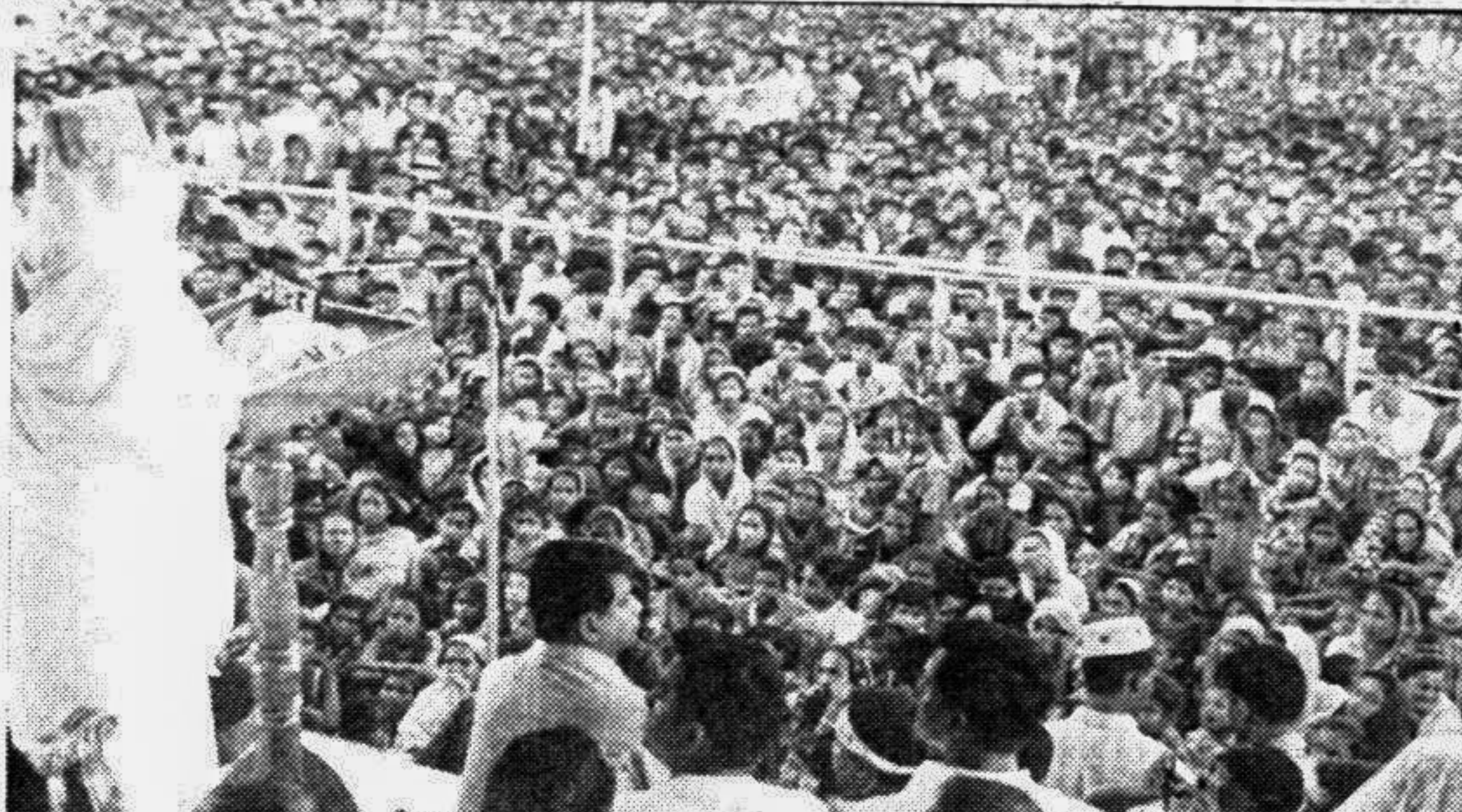
BNP chairperson Khaleda Zia addressing a public meeting at the Kuliarchar Pilot High School under Kishoreganj district yesterday.