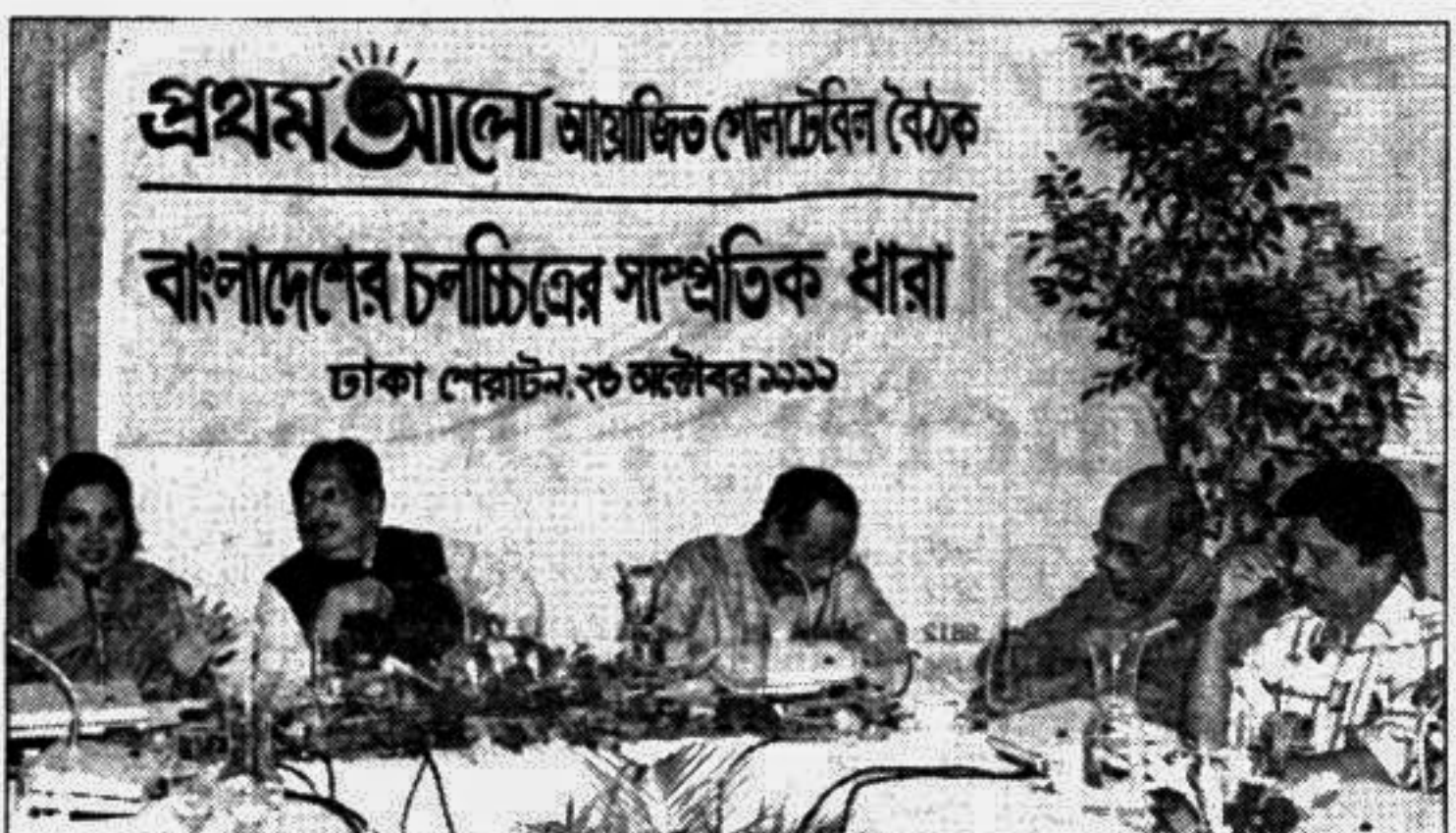
*Prothom Alo organised a roundtable on 'Recent trend in Bangladeshi films' at Hotel Sheraton yesterday.