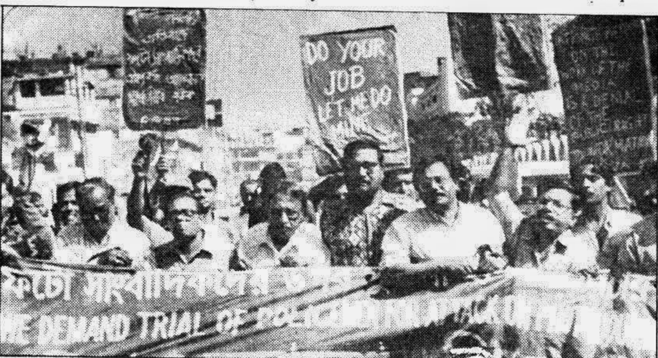
BFUJ staged a rally in the city yesterday in protest of the recent attack on photojournalists by police.