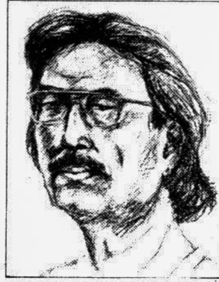
Self Portrait, Charcoal on Paper