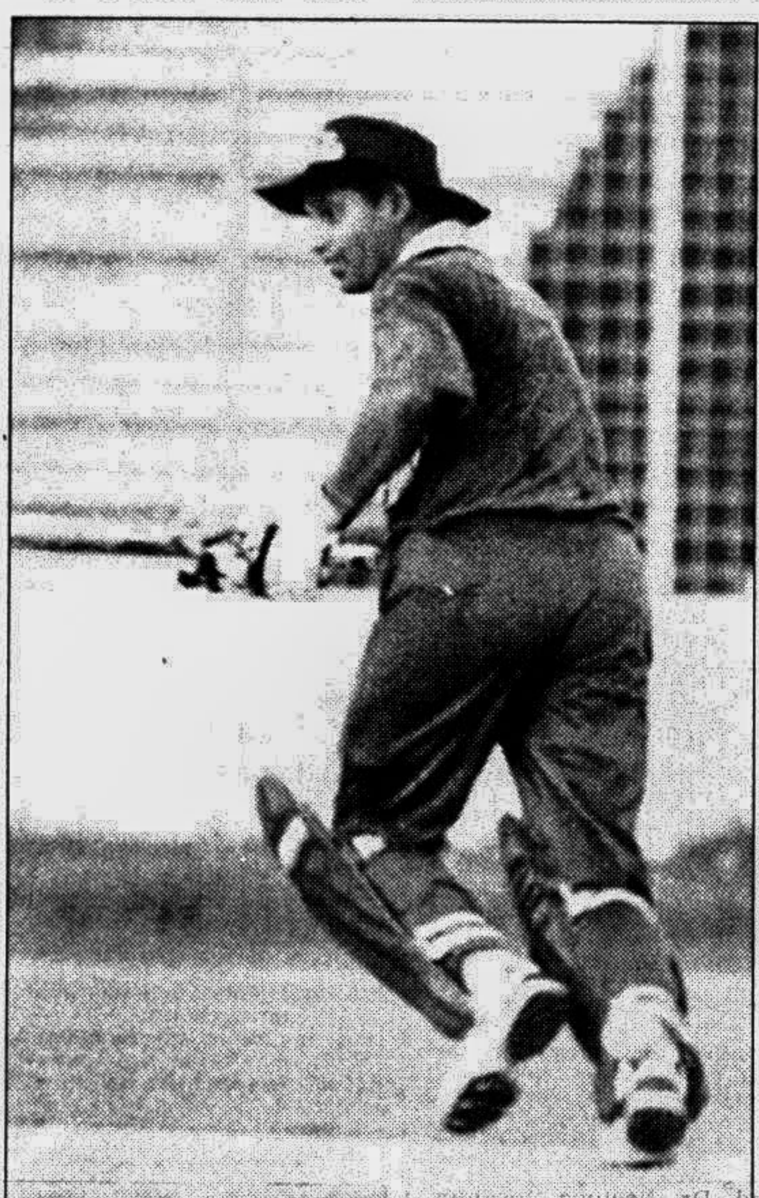
Star file photo of Habibul Bashar

Bangladesh were reduced to 239 for 7 from a commanding position of 219 for 2.