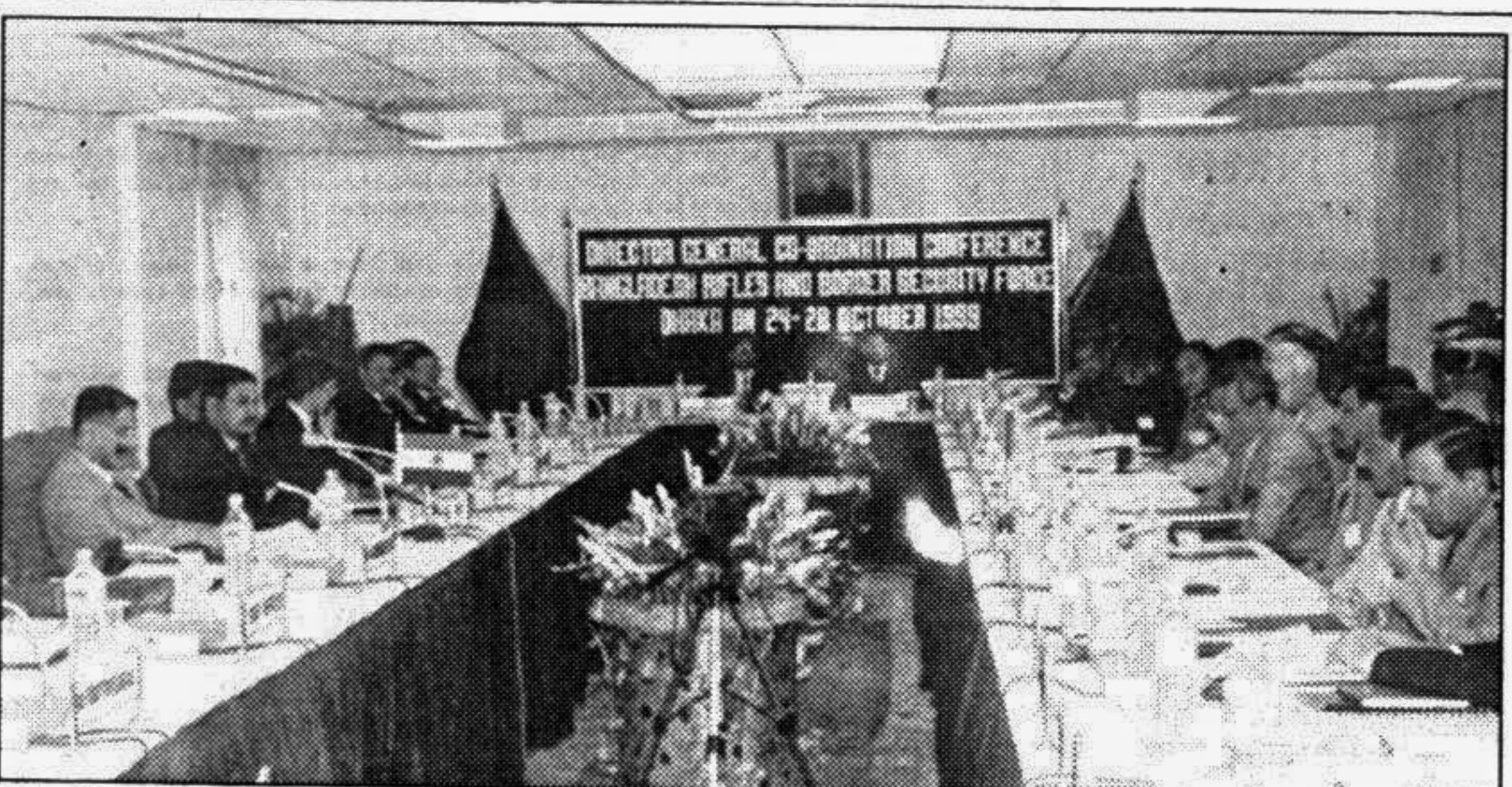
Indo-Bangla border coordination conference in the city yesterday.

The meeting over, BNP activists brought out a procession, which terminated in front of the party central office after parading different city streets.