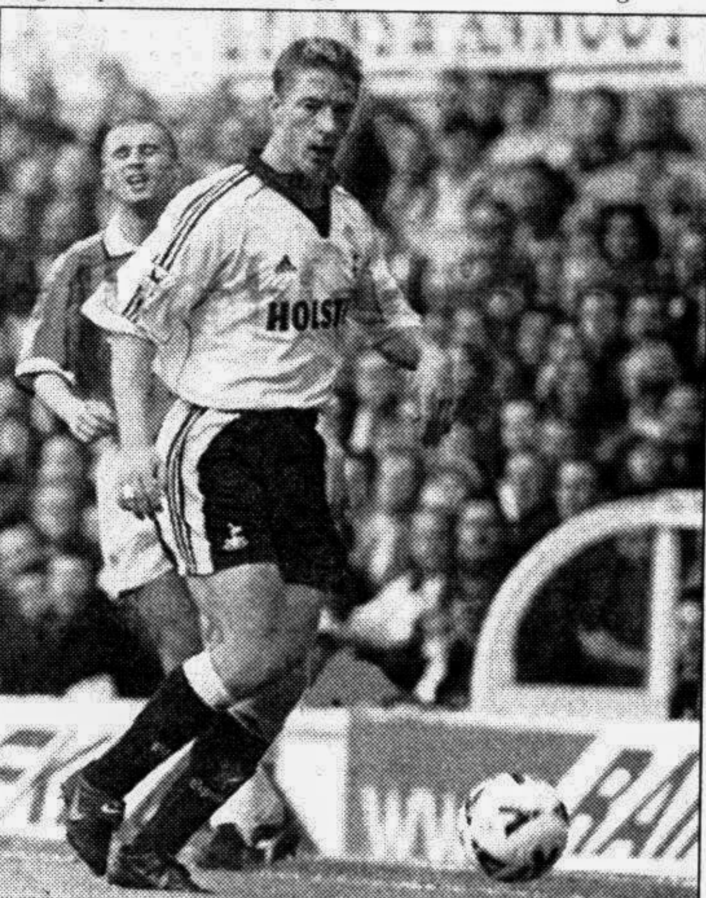
Tottenham Hotspur's Steffen Freund (R) goes past Manchester United's Roy Keane on October 23.

Vialli said: "When you have scored two goals you feel you can do anything because you have such great confidence. This isn't the first time Kanu has scored a great goal. He's so dangerous."