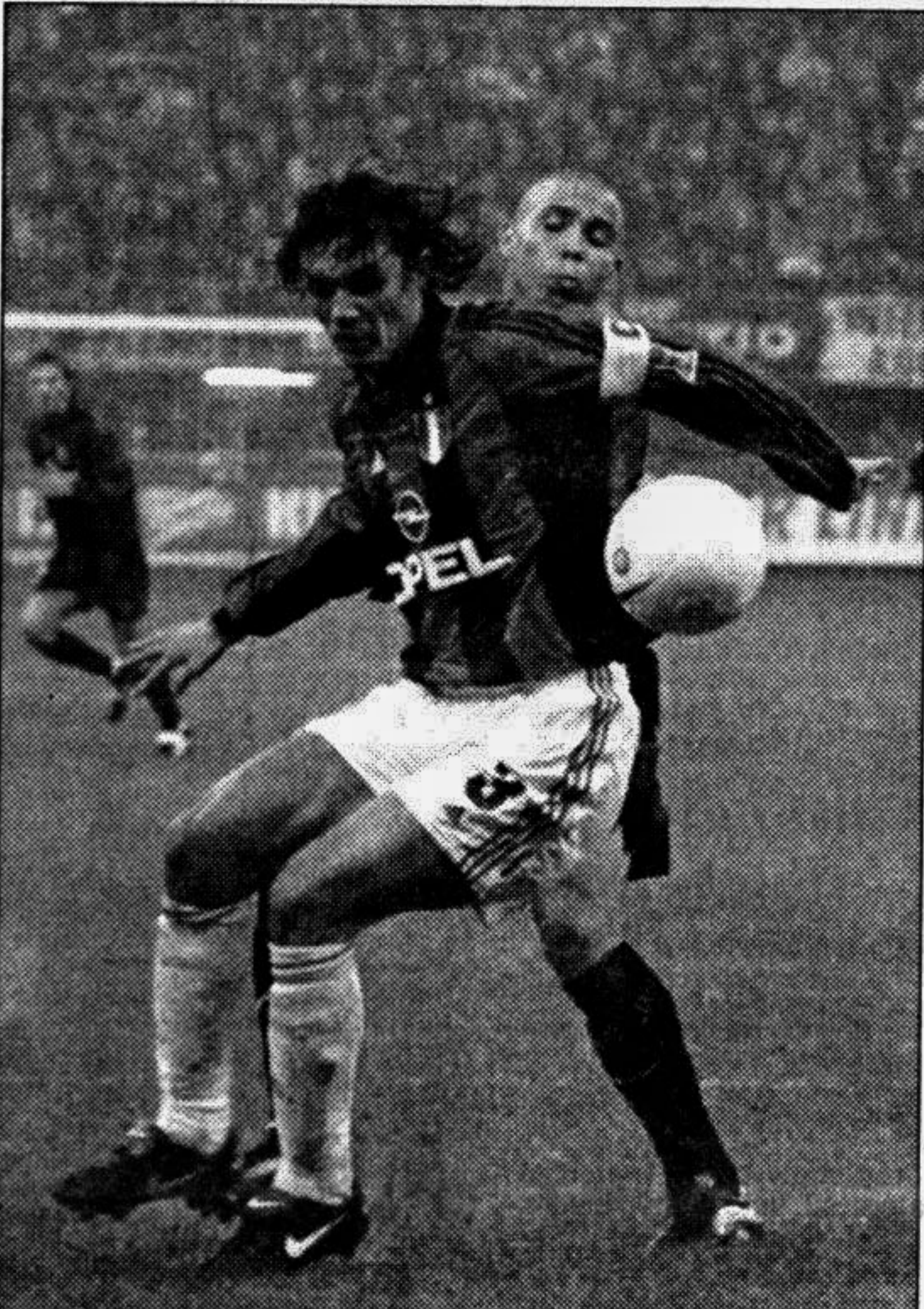
Veteran AC Milan captain Paolo Maldini (L) holding off his counterpart, Inter Milan superstar Ronaldo during their Serie A clash at the San Siro on October 23.

Vieri kept pushing but the breakthrough came for the Italian champions in the 90th minute when Weah rose to head home Boban's corner.