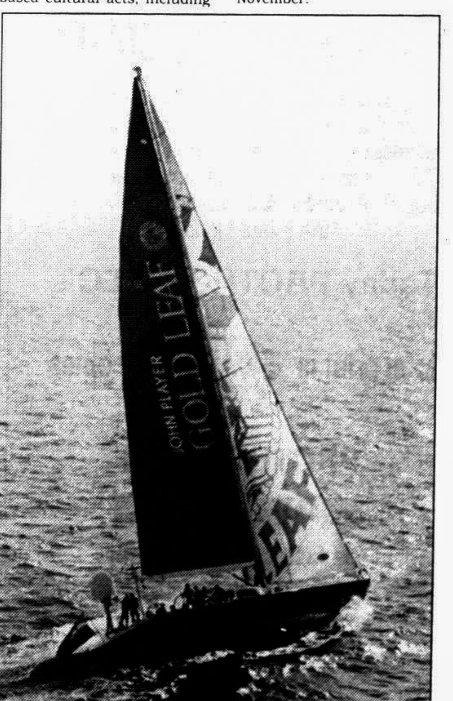
The John Player Gold Leaf boat on the Voyage of Discovery.

The John Player Gold Leaf, an 80ft Maxi racing yacht, left London's Tower Bridge on Saturday June 19th bound for the Voyage of Discovery. The proposed 170-day voyage has seen the yacht skirting the coastlines of three continents through some of the world's most testing waters, including France, Italy, Egypt, Cyprus, Oman, Djibouti, Pakistan, Saudi Arabia and the UAE. The final leg of the route will take the journey south to Goa, Sri Lanka and Bangladesh and will end in the Bay of Bengal in mid-November.