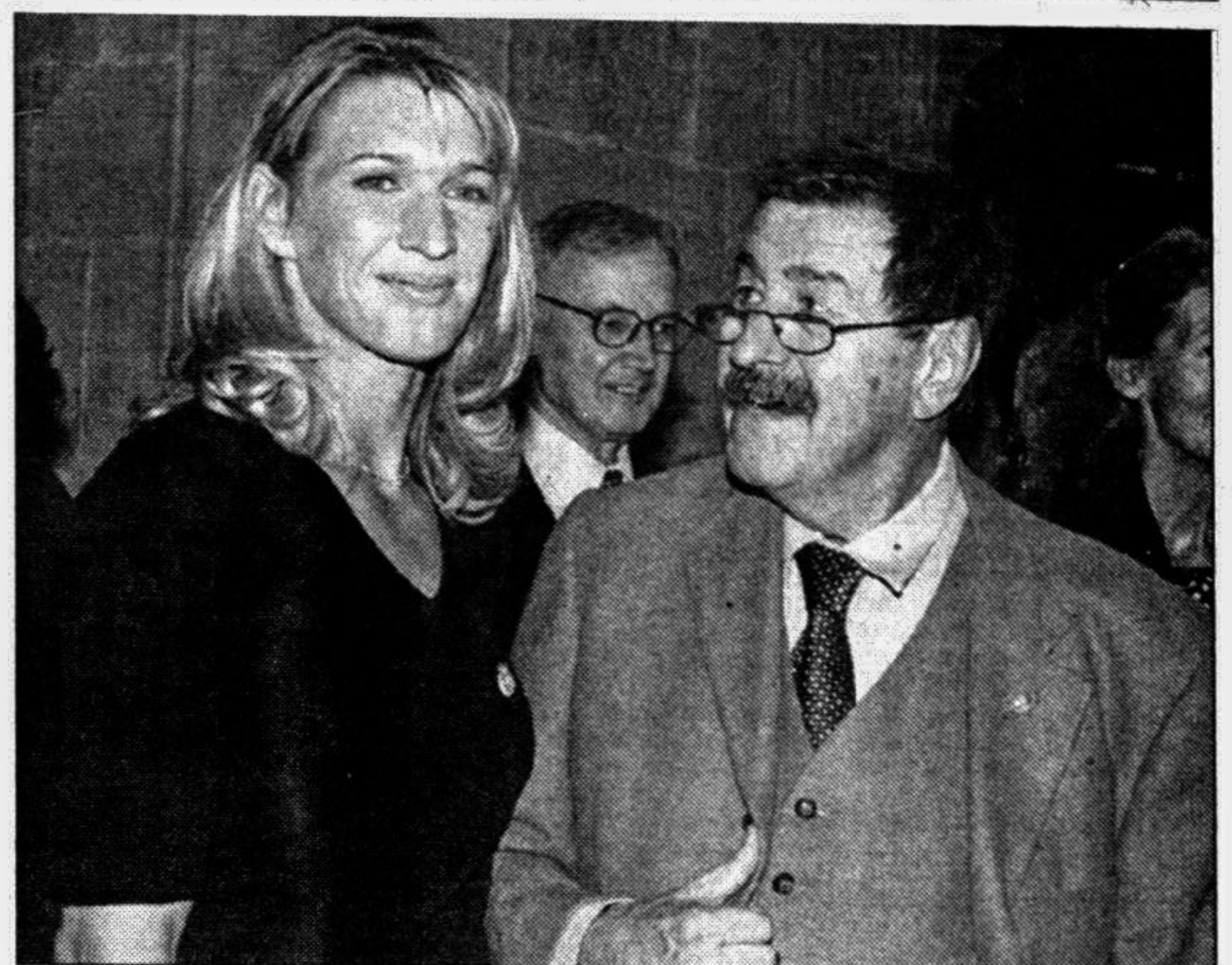
Nobel laureate German author Gunter Grass (R) chats with former world No 1 tennis player Steffi Graf during a reception in Oviedo, Spain on October 22.

But Morocco had other elite runners and Khannouchi didn't get the support he wanted from his country's running federation. So in 1993, he moved to New York without money or a job.