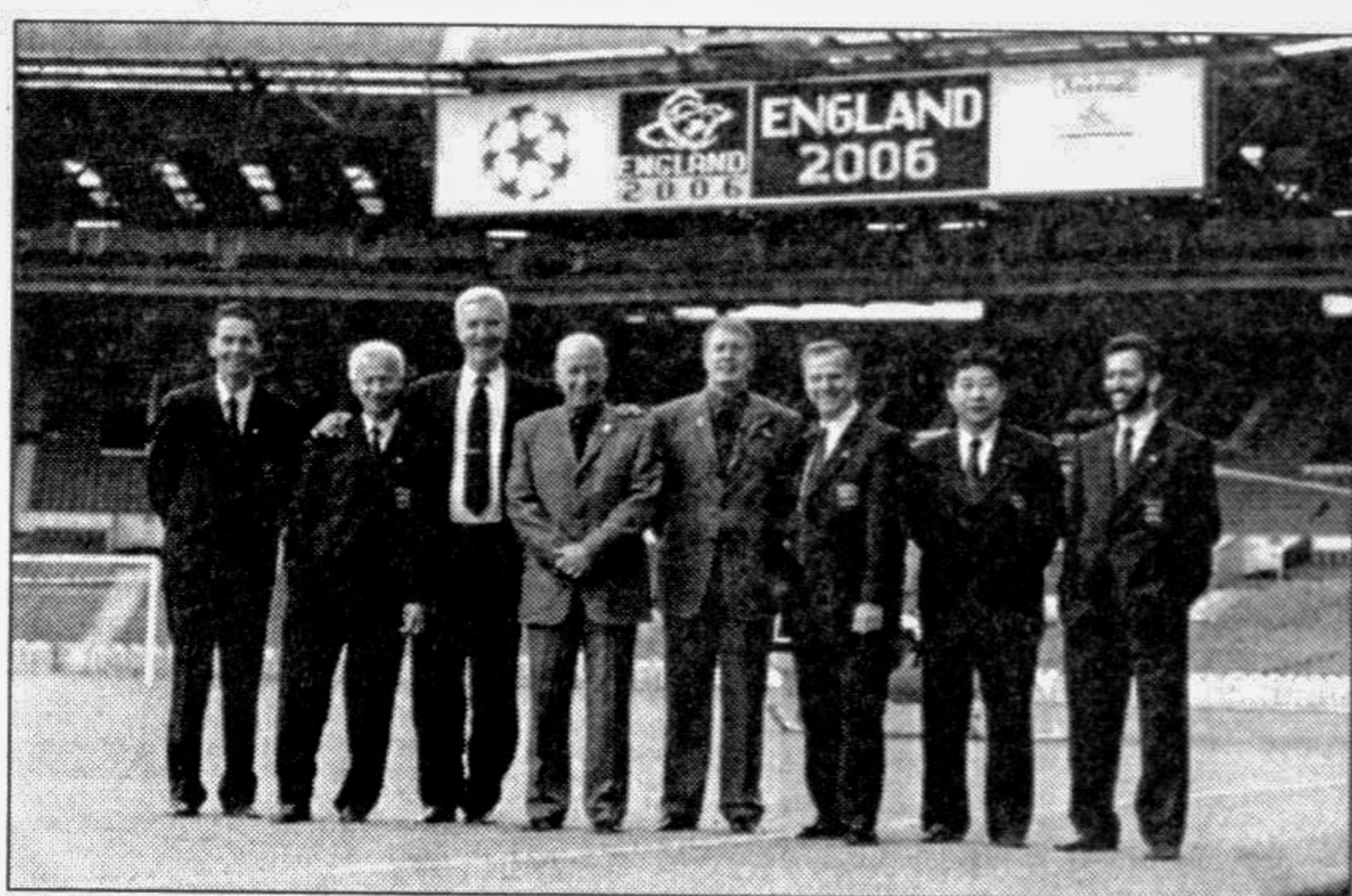
The members of the FIFA delegation pose at Wembley Stadium on October 22. They were accompanied by the English 2006 bid team.