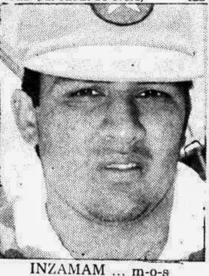
INZAMAM ... m-o-s

Spinner Chandana brought Sri Lanka back into the game by bowling Yousuf Youhana off his bat and then having teenager Hassan Raza stumped by Kaluwitharana. Chandana, who also ran out Moin Khan with a direct throw to the stumps, finished with 3 for 40 from 10 overs. Akram, who won the toss for the fifth straight time, rode his luck to hit 30 from 26 balls and rally his side from 148 in six. Akram hit two fours and a six before falling to left-arm pacer Nuwan Zoysa. Opening bowler Chaminda Vaas had fine figures of one for 20 from eight overs, and also got rid of Shahid Afridi cheaply. The Pakistanis finished the tournament unbeaten, having topped the double header league with seven points, including a tie with the Lankans in the first round. They have been playing in Sharjah Stadium since the early 1980s. West Indies finished last