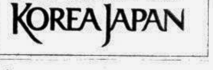
2002 FIFA WORLD CUP KOREA JAPAN