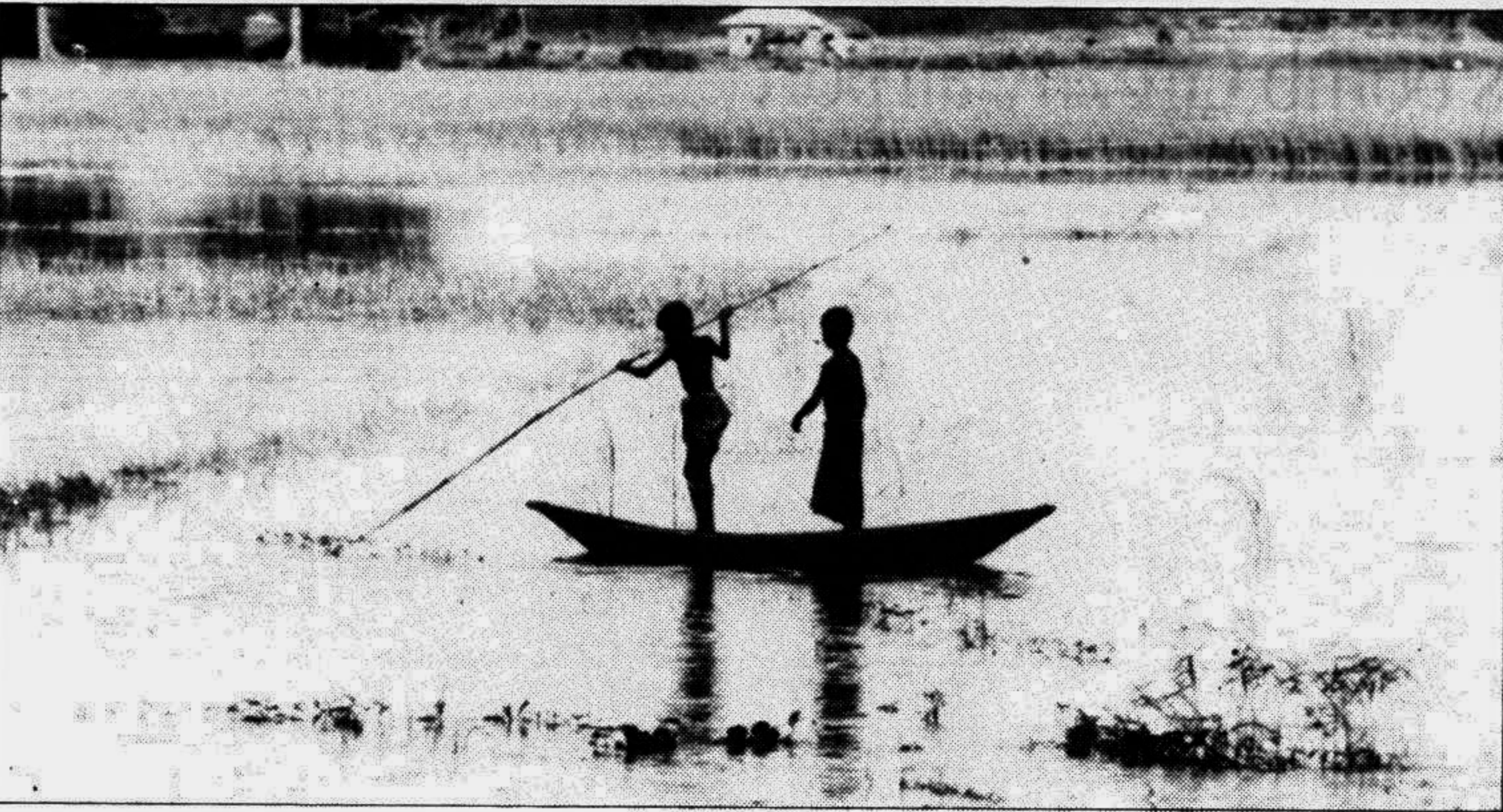
Fishing in paddy fields: Waters of the flash flood have receded from Mohonpur thana in Rajshahi district damaging the paddy fields there. Photo shows two little boys are engaged in fishing in the area.

From A Correspondent SIRAJGANJ, Oct 23: Although the construction of Sirajganj Town Protection Embankment has been completed, affected people, whose lands have been acquired for project, are yet to get compensation. Authorities acquired 77.365 acres permanently and 37.54 acres temporarily in Ranigram, Golla, Gurkha and Dhanbandi moogas under Sadar thana for the project, financed by the World Bank. A total of 137 landowners were considered affected for the construction by the authorities. Victims have attributed the delay in paying compensation money to bureaucratic tangles. Affected people recently submitted a memorandum to the deputy commissioner demanding immediate payment. Local people have urged the authorities concerned to take immediate steps.