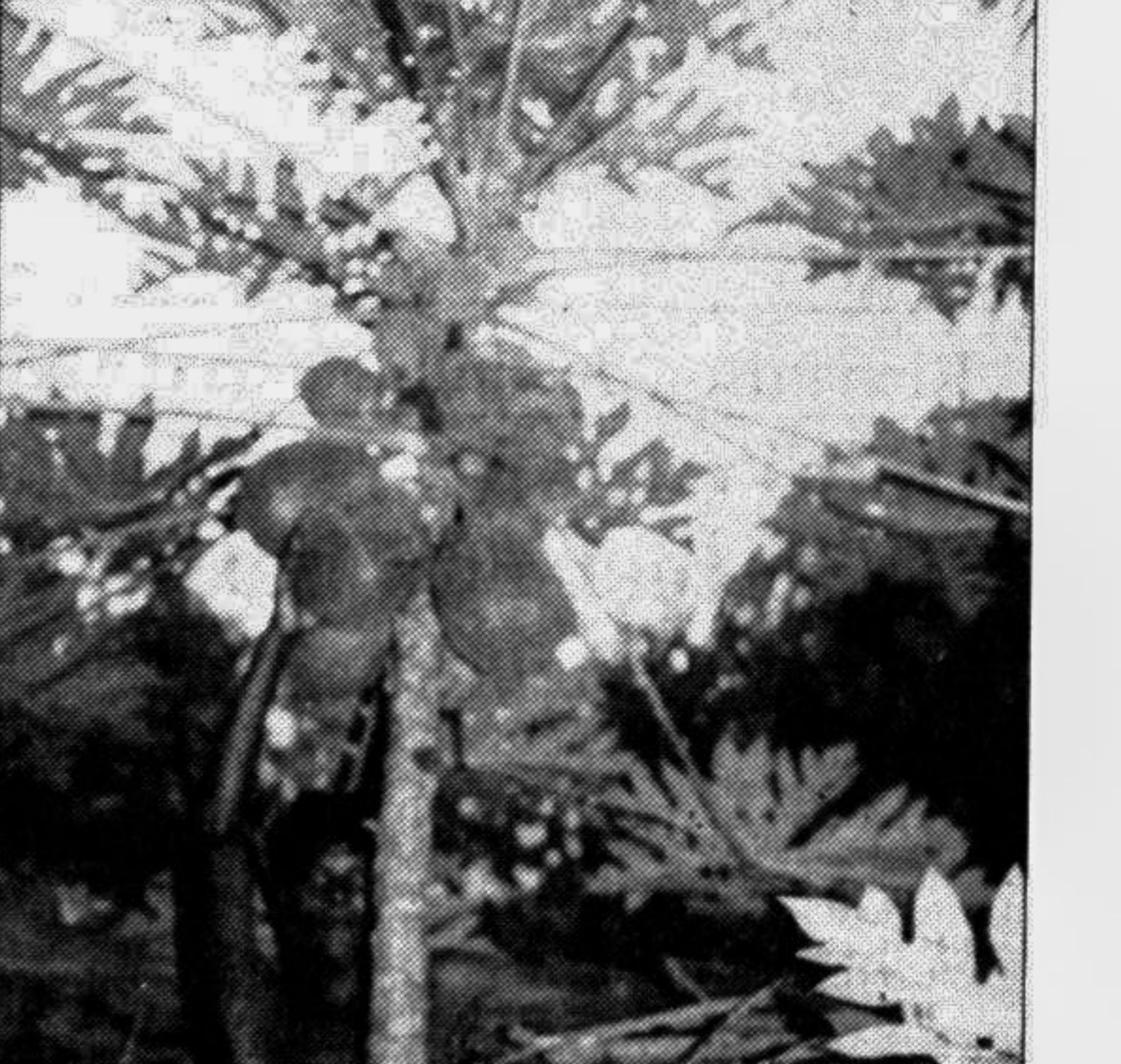
Papaya cultivation has been gaining momentum in Jamalpur district recently. A student of Class Ten of village Mollahpara in sadar thana cultivating papaya around his reading room.