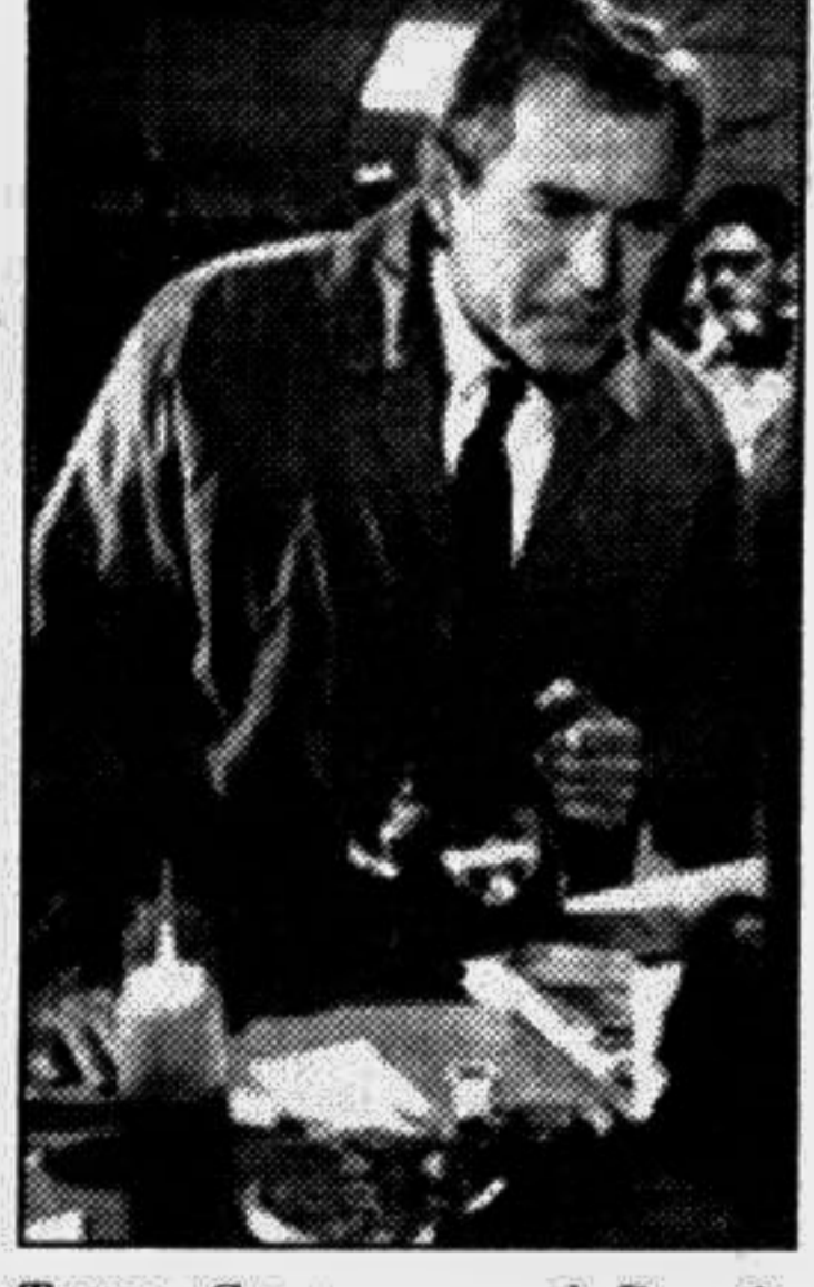
Texas Governor and Republican US presidential hopeful George W. Bush listens to a patron as he serves coffee while on a campaign stop in the Country Kitchen Restaurant Friday in Newport, New Hampshire.

brother, Shabbaz, former chief minister of Pakistan's largest Punjab province also is in protective custody.