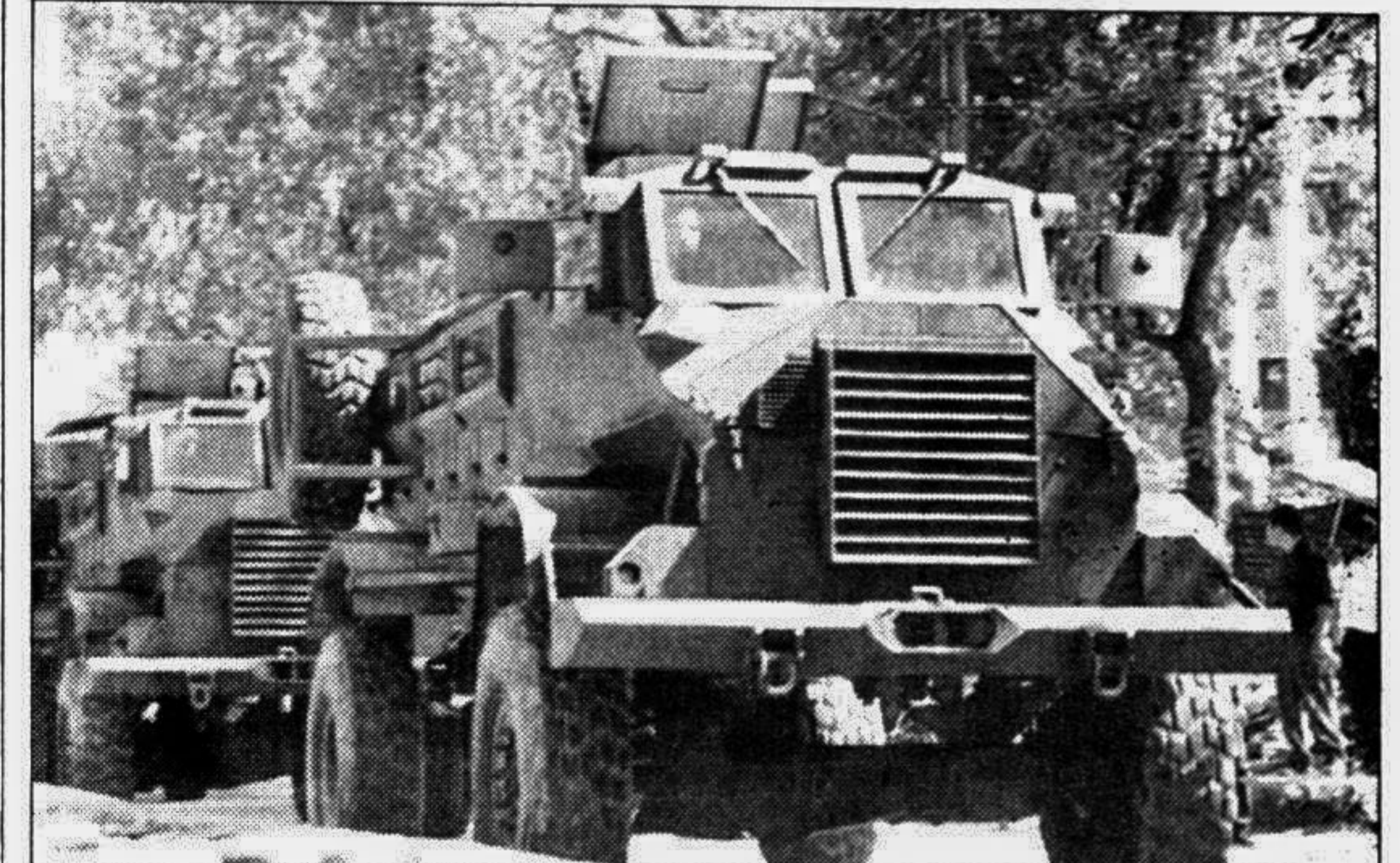
Indian Army anti-mine Casper armoured vehicles drive through downtown Guwahati, on their way to anti-insurgency operations in this troubled north-eastern state Friday.

WASHINGTON, Oct 23: India is likely to launch a 5,000-KM range missile, Surya, in mid-2001, the Defence News Weekly said, reports PTI.