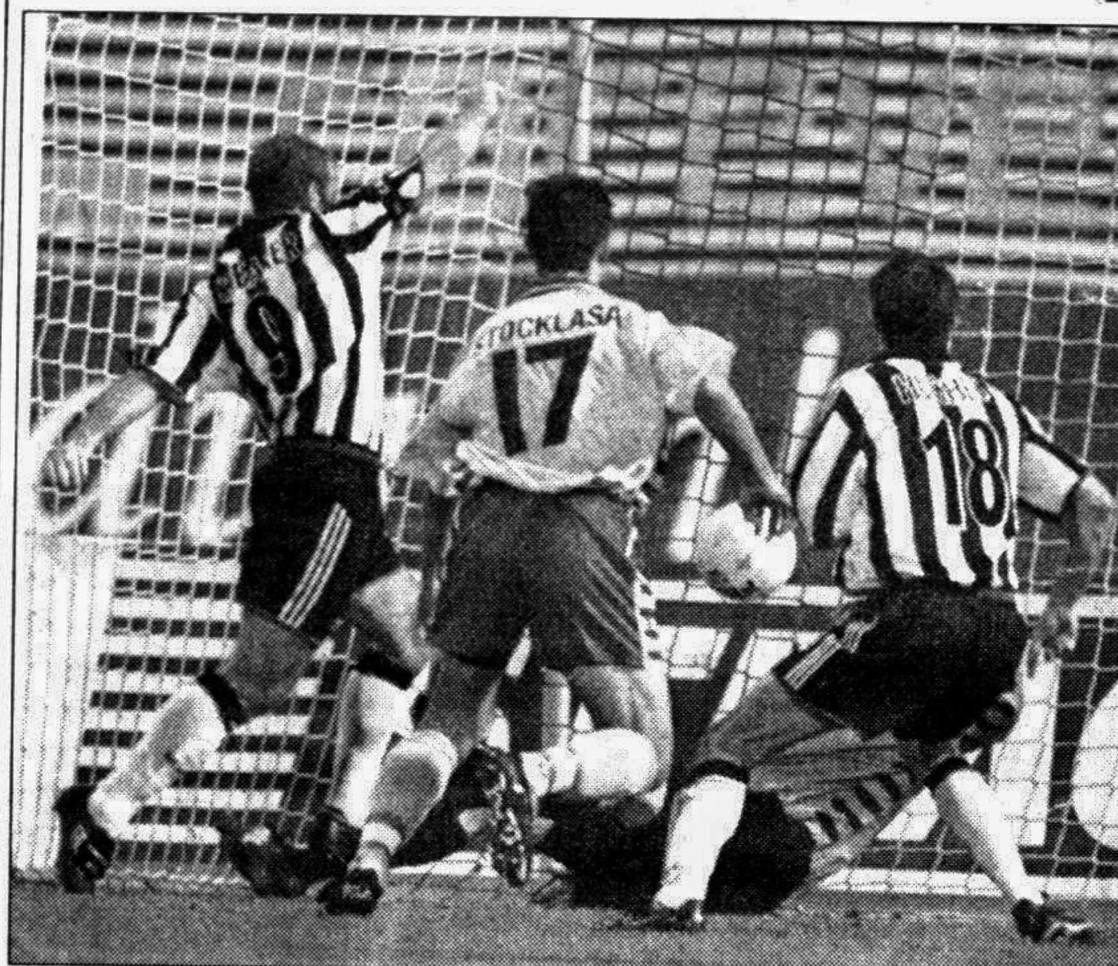
Newcastle's Alan Shearer (L) scores his team's second goal against FC Zurich.