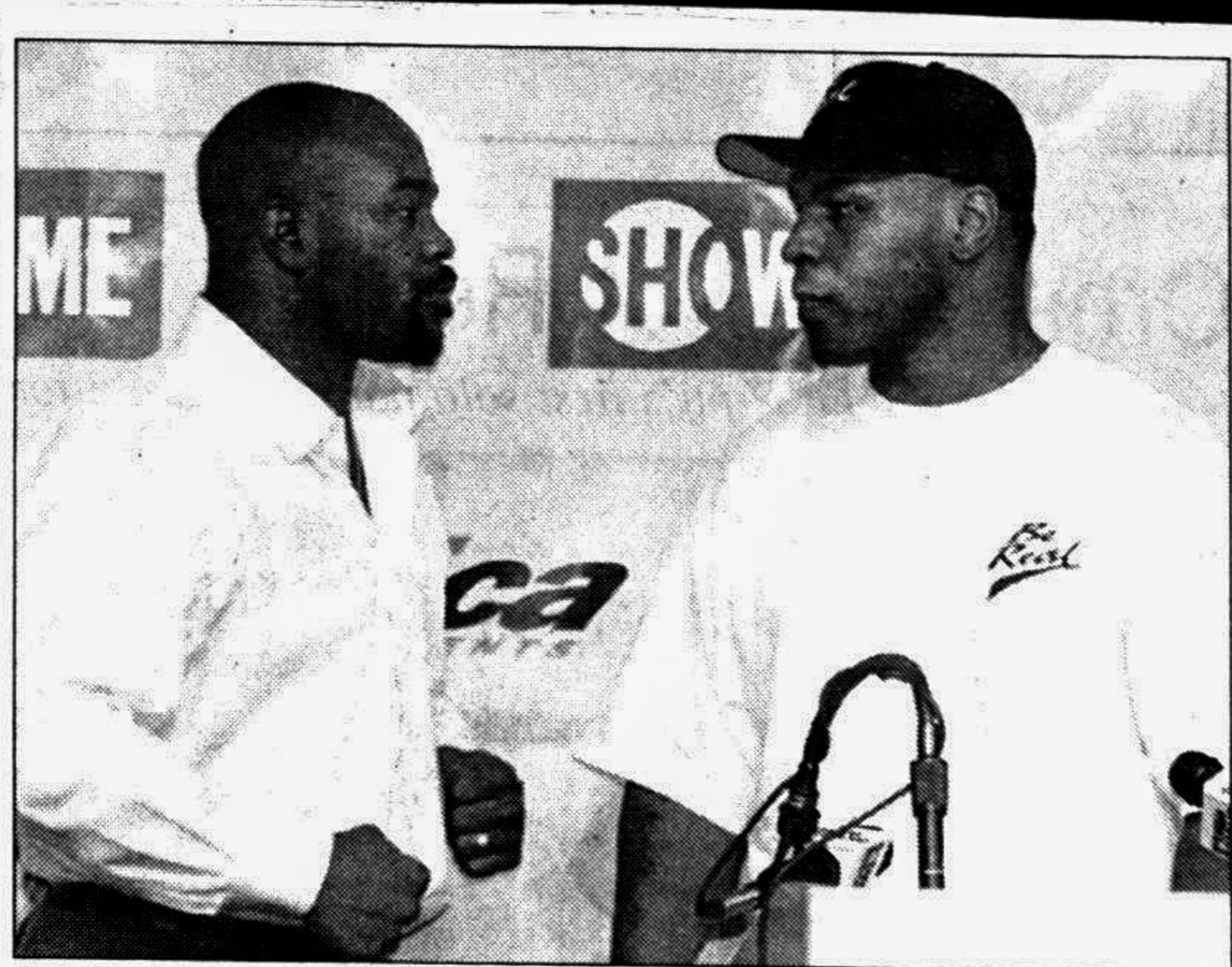
LOOK WHO'S TALKING: Former heavyweight champion Mike Tyson (R) faces opponent Orlin Norris during a press briefing at the MGM Grand Hotel in Nevada on October 20.