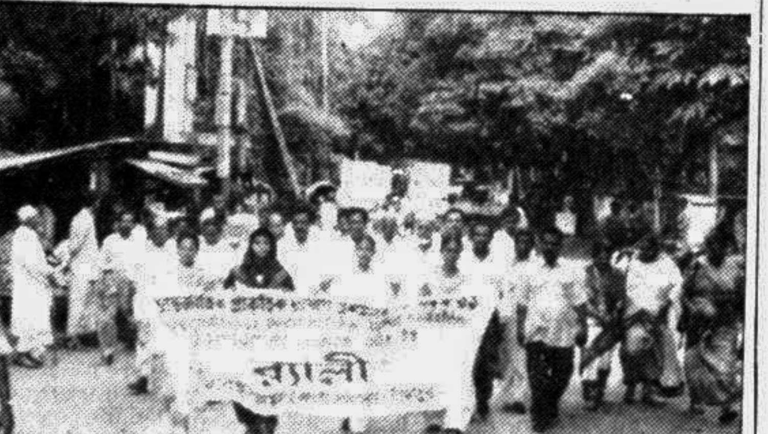
A colourful rally was brought out in Chandpur town recently on the occasion of International Decade for Natural Disaster Reduction.