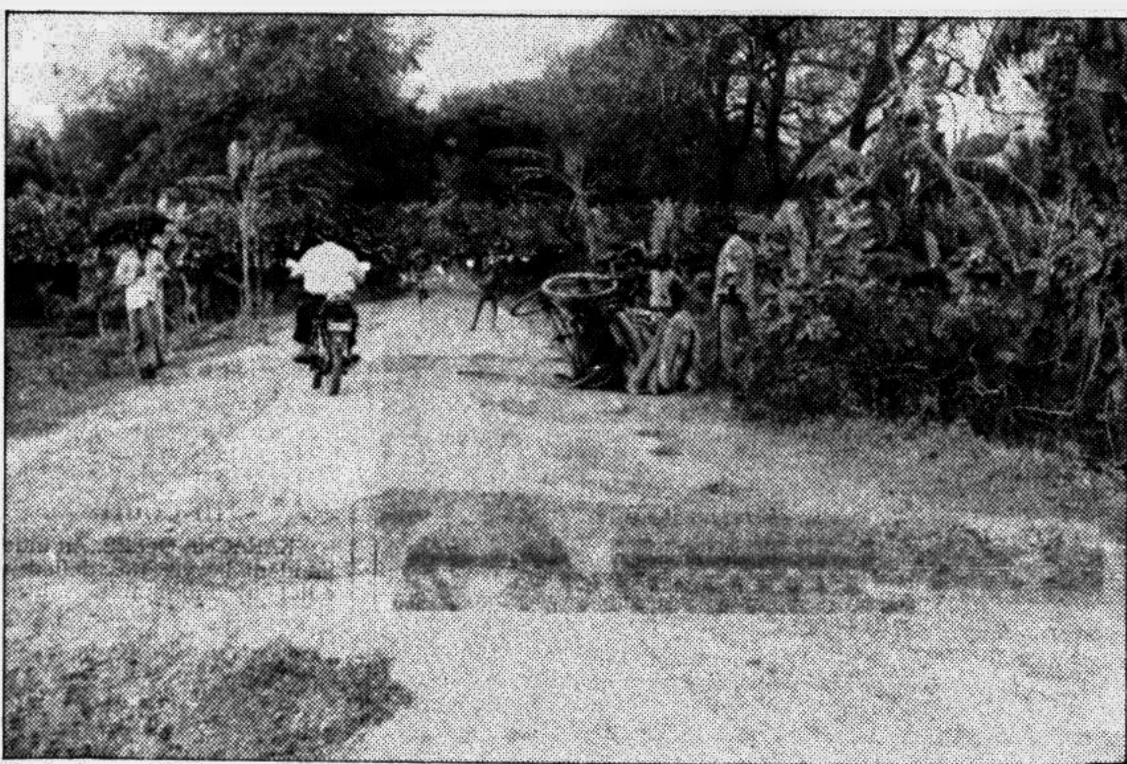
Bad shape of Magura-Sreepur road. It needs immediate repair.

People buy mosquito coils from markets, but the products prove to be useless as they cannot prevent the inmates from mosquito-bites. People alleged that these coils are spurious and ineffective and their thick smoke creates health hazards. But there is none to look into the matter and bring these dishonest traders to book.