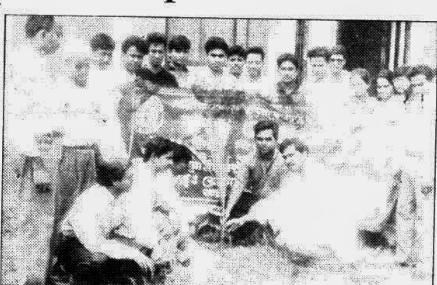
The president of Jalalabad Rotary Club planting a sapling recently inside the premises of Regional Resource Centre of Bangladesh Open University.