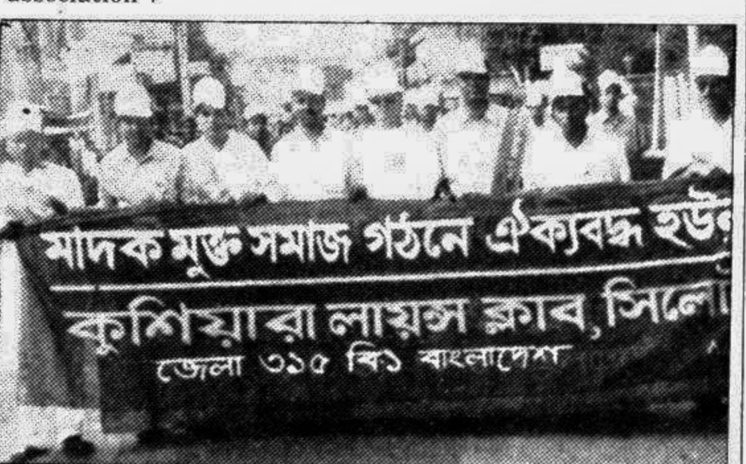
Kushiyara Lions Club, Sylhet brought out a rally in the divisional town recently campaigning against drug addiction.