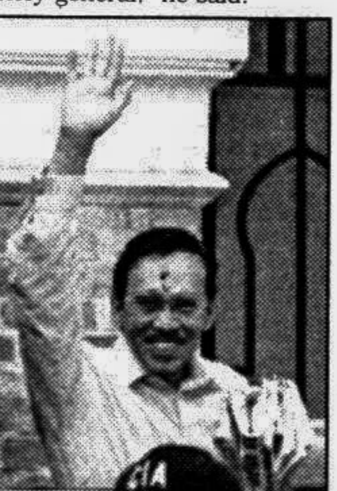
Sacked Malaysian deputy premier Anwar Ibrahim waves to his supporters at the Federal Court building in Kuala Lumpur yesterday.

"I told the prime minister Daim has no right or responsibility to control or guide the attorney-general," he said.