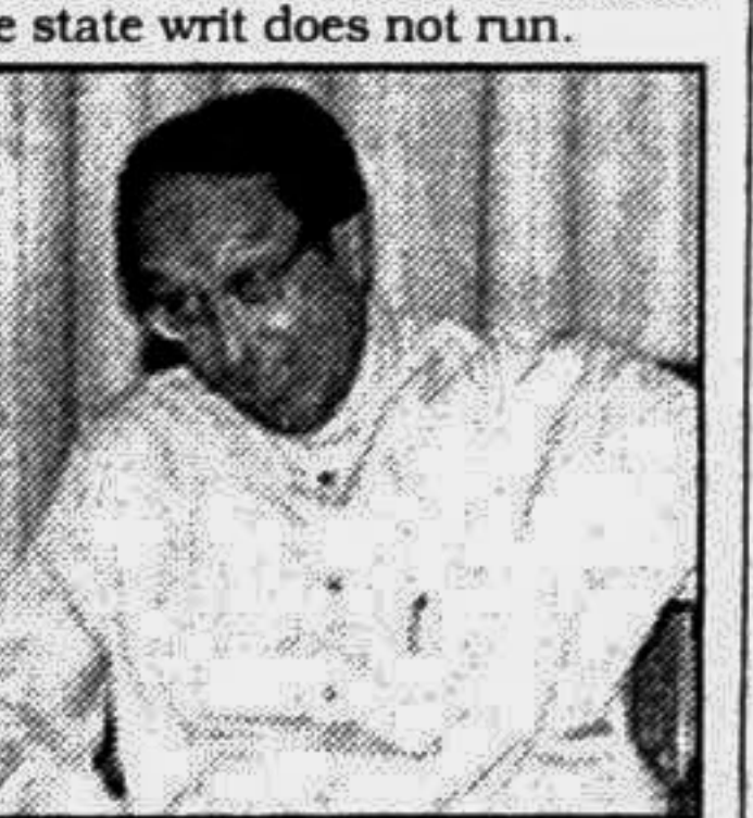
Sri Lanka's former finance minister Ronnie de Mel speaks to reporters yesterday to announce the main opposition United National Party's call for international observers to monitor presidential elections due before January. De Mel warned that they will lead people to the streets and launch a civil disobedience campaign if the ruling party tried to rig the election.

Hundreds of thousands of people are displaced and live as refugees within the country while Tamil Tiger rebels control several areas of the island's north as well as the east where the state writ does not run.