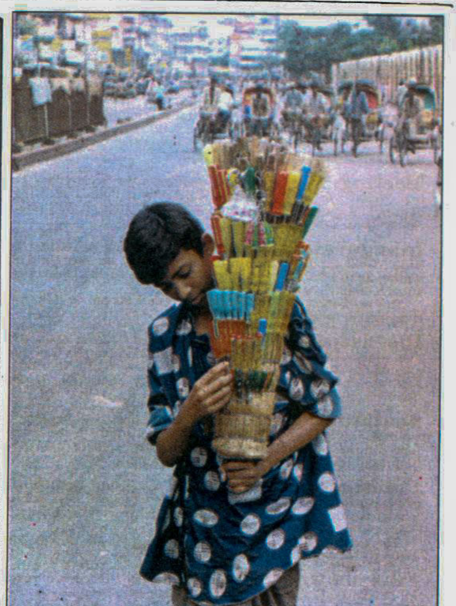
Oh trade, no trade A street vendor counts his products in the vain hope: maybe he has sold some. While his customers stayed away, so did his lady luck.