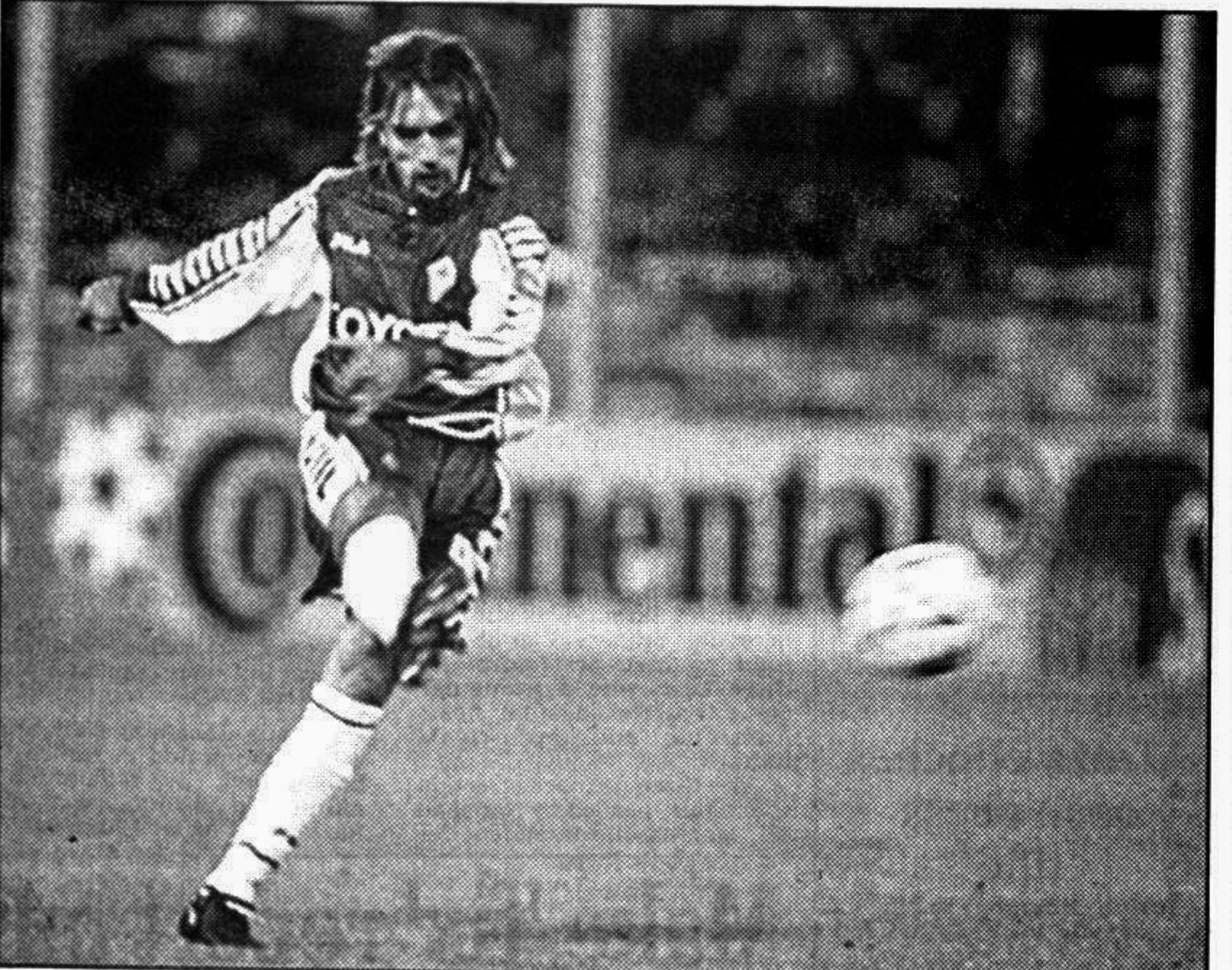
Fiorentina's Argentine striker Gabriel Batistuta blasts in his team's first goal against Aik Solna during their Champions' League match on October 19.

Lazio now have 10 points from four games and have virtually earned their qualification into the second phase.