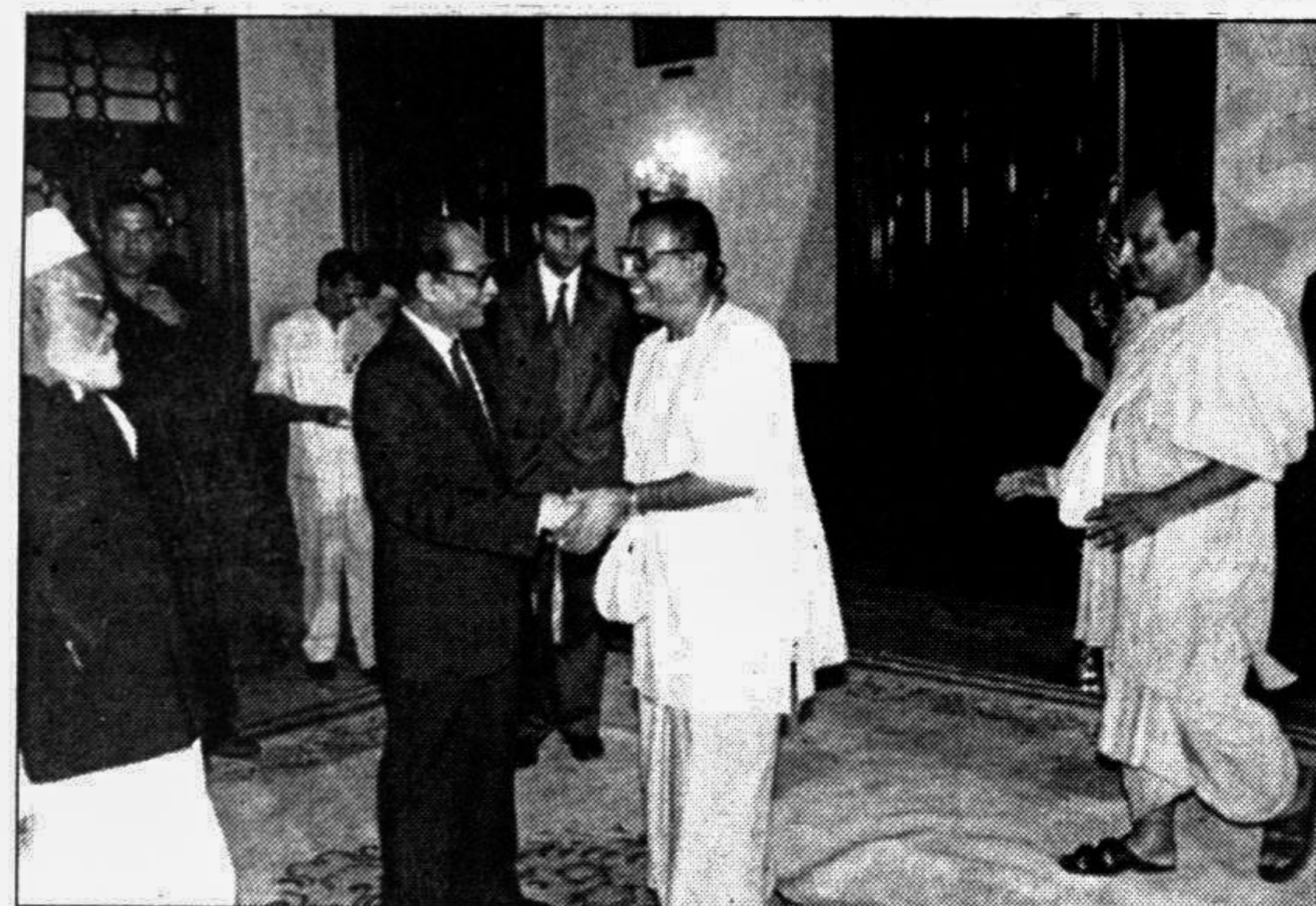
President Shahabuddin Ahmed exchanged pleasantries with the members of the Hindu community at Bangabhaban yesterday on the occasion of Durga Puja.

Meanwhile, Al-Markajul Islami would organise a press conference at the Photo-Journalists Association auditorium in the city at 1 pm today to announce tough programmes in freeing its leaders, the press release added.