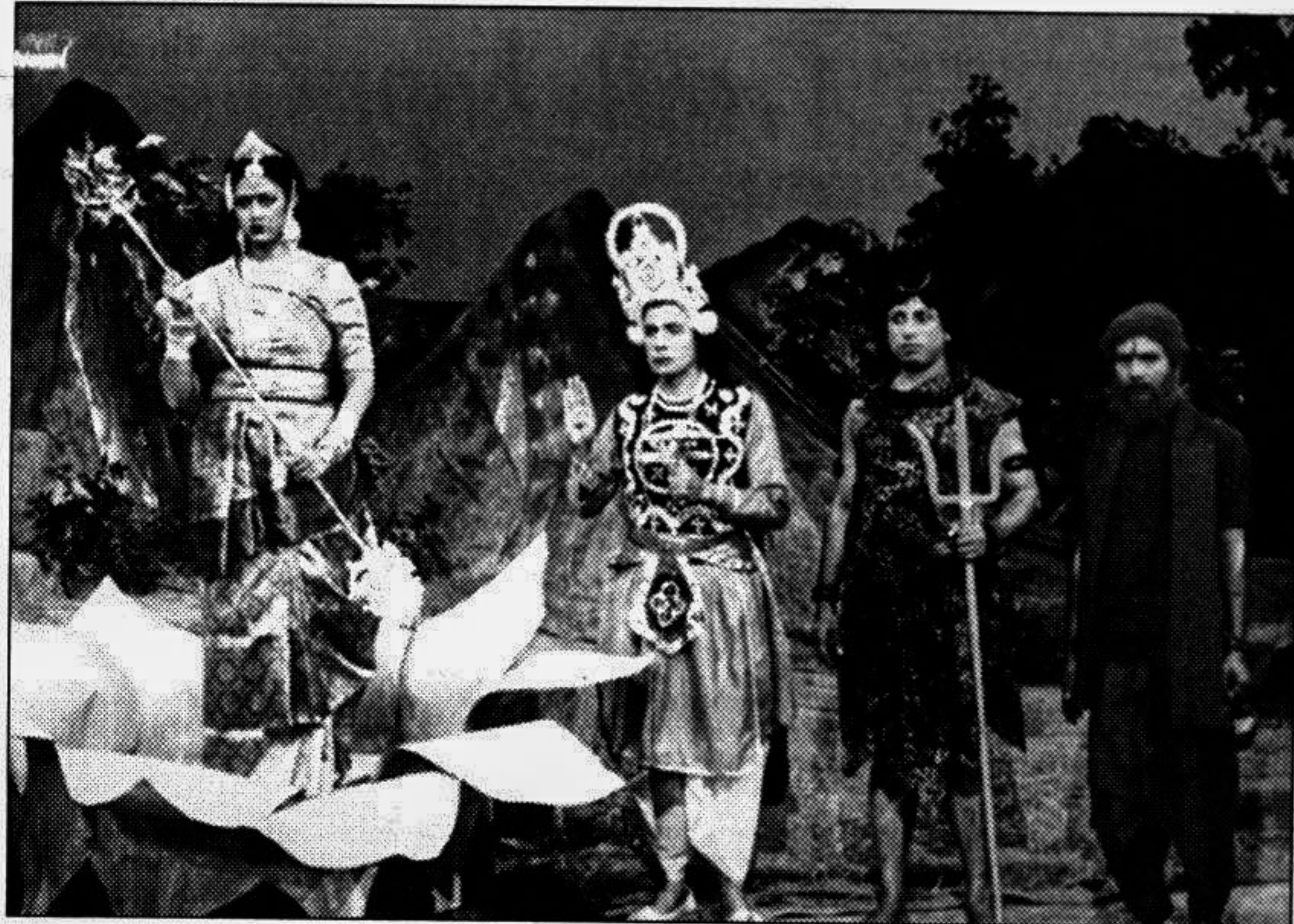
A scene of Kripamoyee Ma, a special programme on Durga Puja to be telecast on Wednesday.