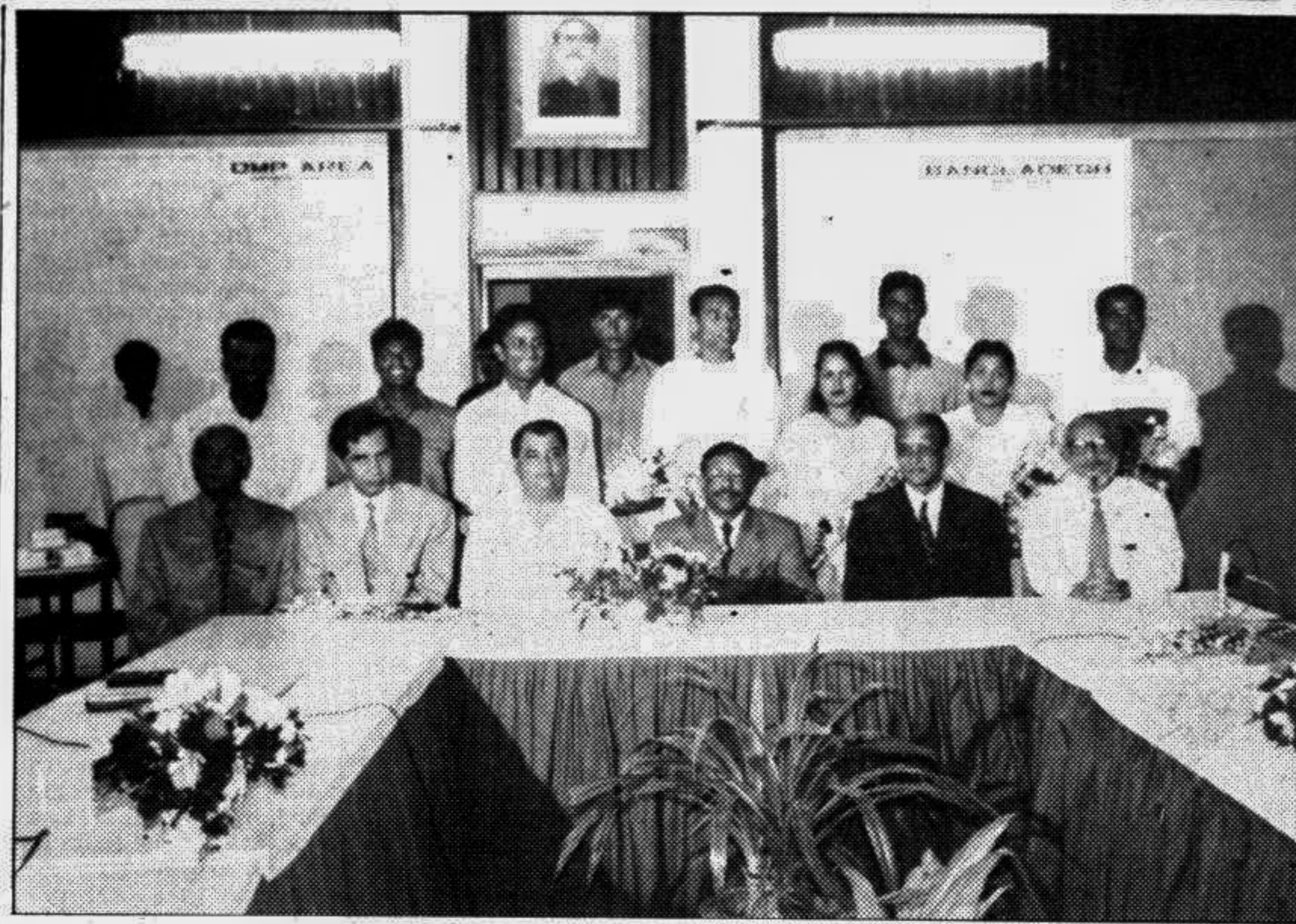
National Sports Council awardee footballer, shooters and cricketers pose with NSC chairman and Youth and Sports Minister Obaidul Quader (sitting 2nd from R) and other officials during the prize-giving ceremony yesterday.

The final of the SA Cup competition is scheduled to be played on March 24 the winners of which will then meet Gloucester in a day-night game on their home ground.