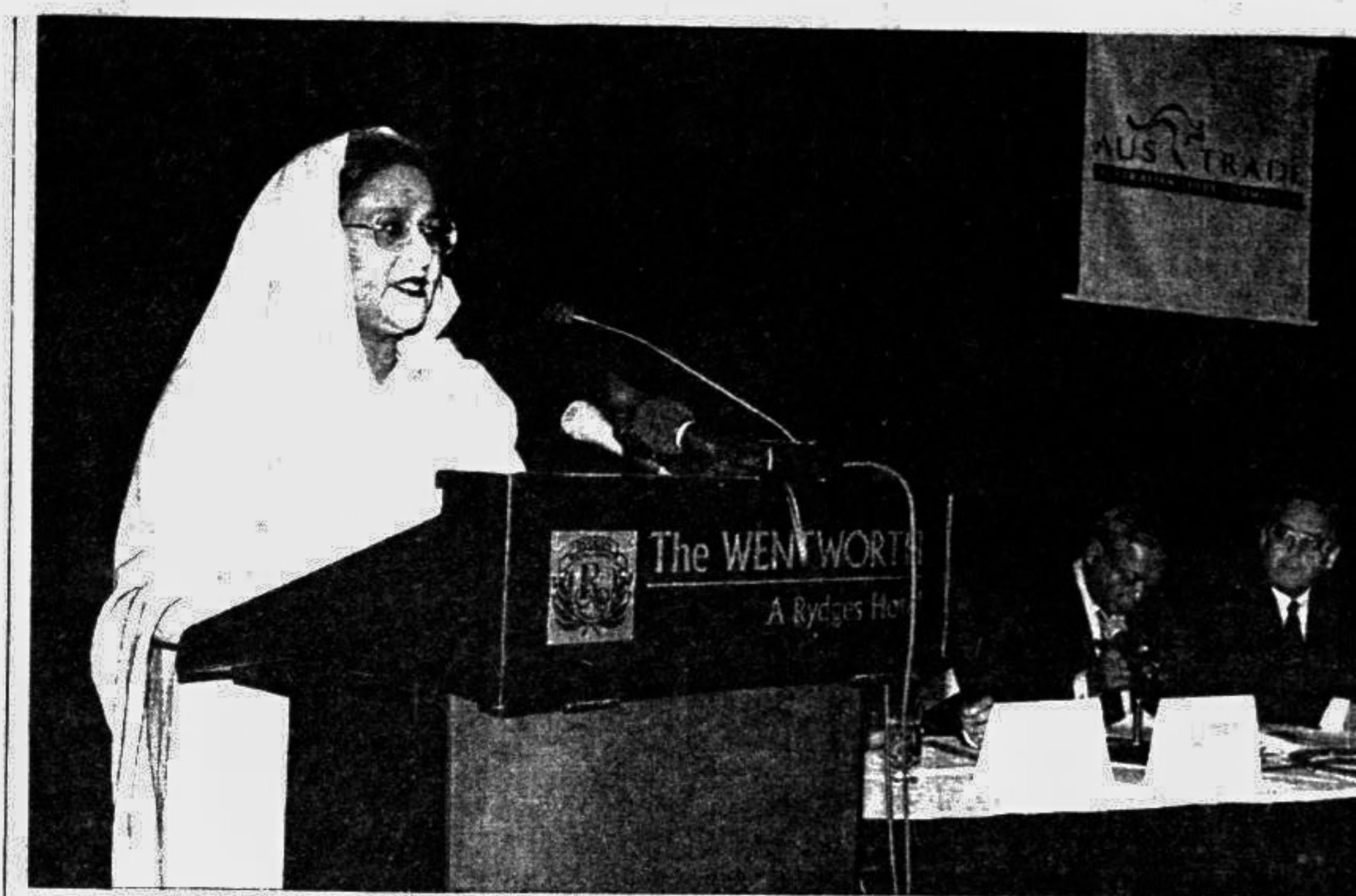
Prime Minister Sheikh Hasina addressing the Australian business leaders in Sydney yesterday.