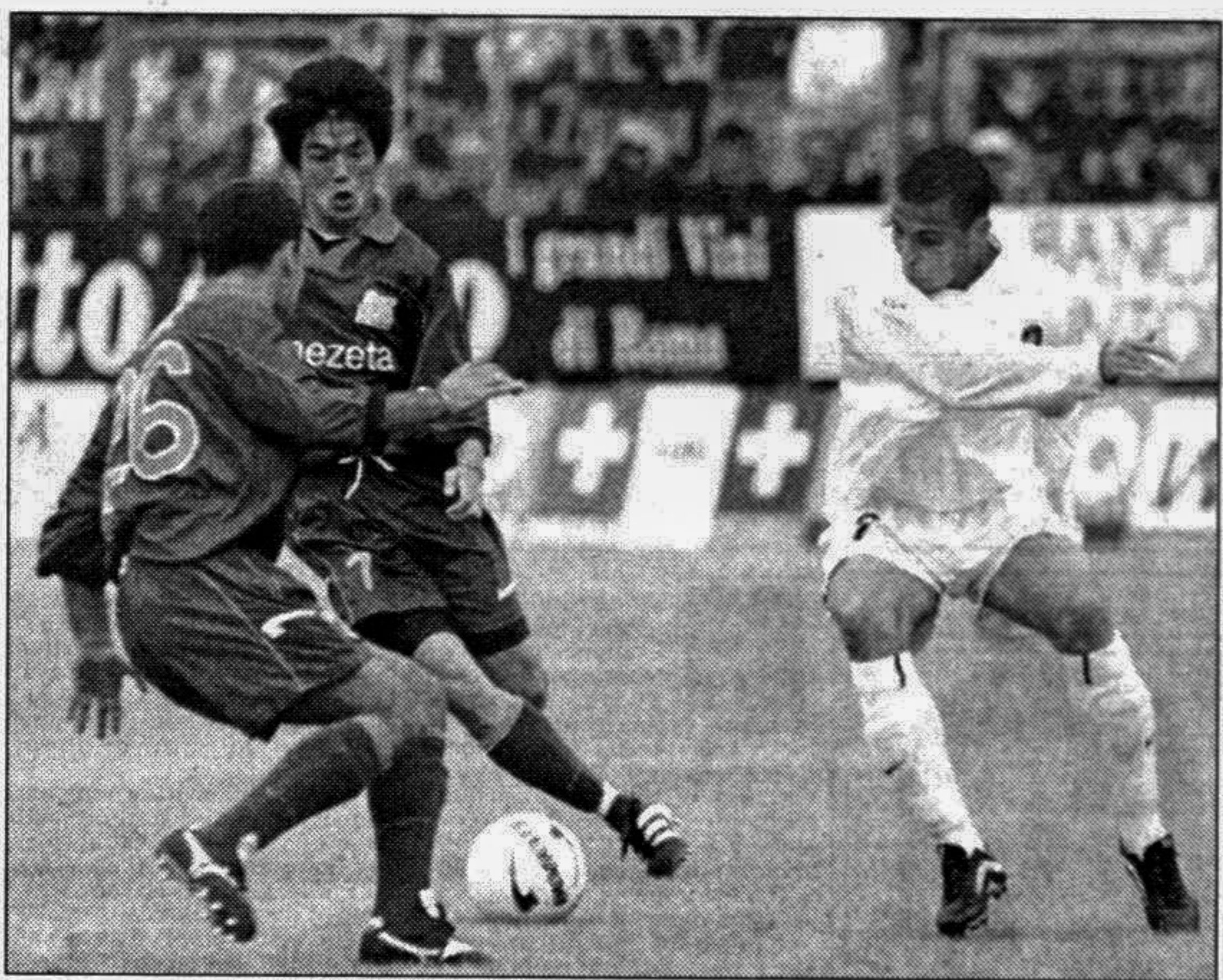
Scene from the Serie A encounter between Inter Milan and Venezia on October 17.

Germany faces stiff opposition from another European candidate England while South Africa, Morocco and Brazil are all still contenders. Beckenbauer tried to soothe Villar's anger, saying: "I can understand his unhappiness and I will go to Spain to smooth over the ground. Now we must work hard to make up the lost ground."