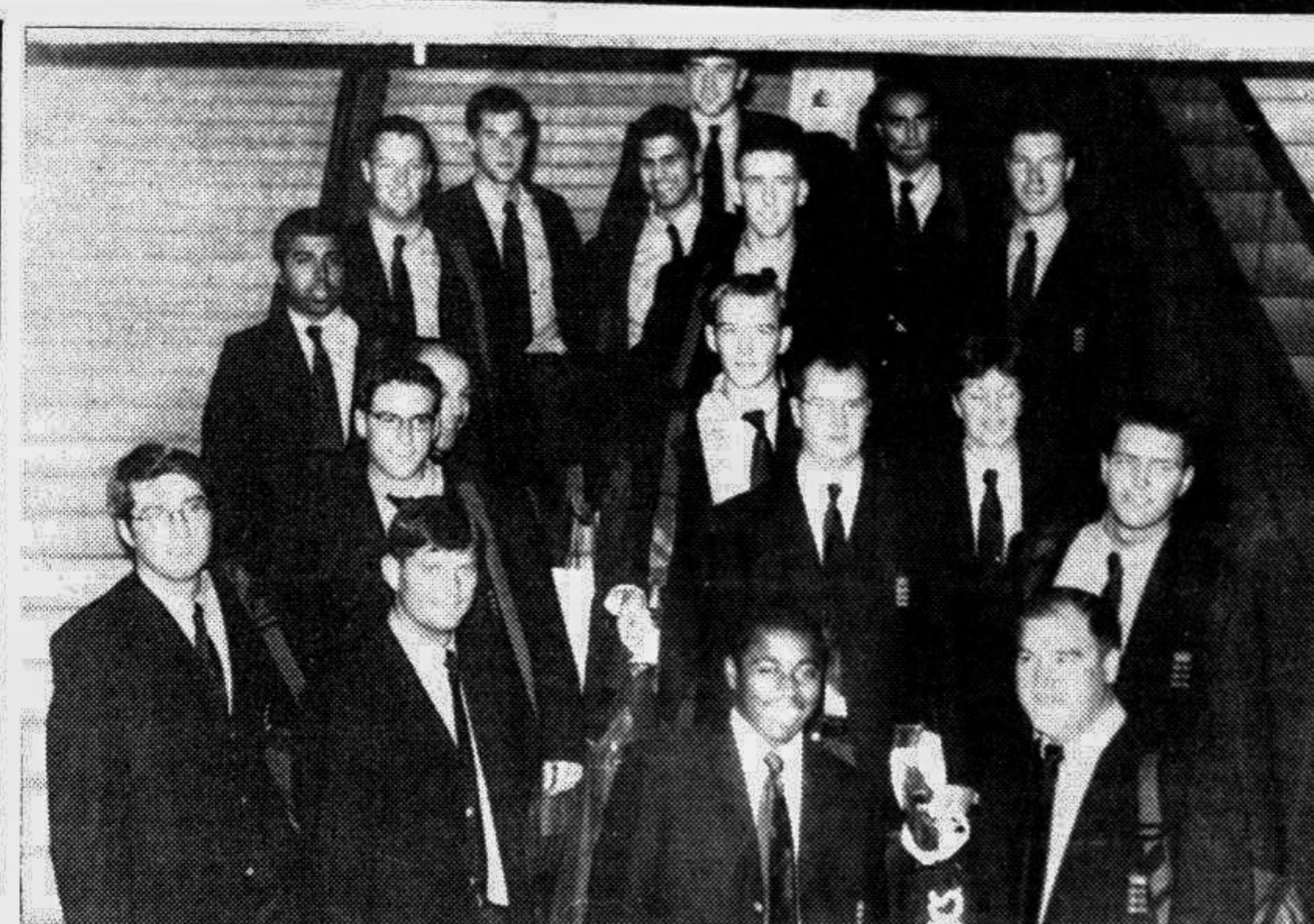
Players and officials of England A cricket team that arrived yesterday.

M M Islam improved the national mark in 50 m freestyle with the time of 25.13 seconds, previous time was 25.24. K M M Islam bettered national record in 100 m freestyle taking 55.32 seconds. The previous record was 57.57. Both of them belong to Bangladesh Navy.