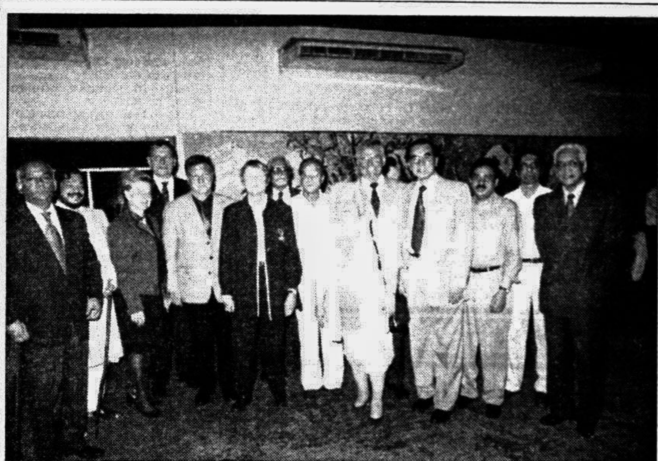
Members of the visiting German parliamentary delegation at the reception hosted by the Daily Star yesterday.

The liaison committee meeting was attended by BNP leaders Tariqul Islam, M Shamsul Islam MP and Anwar Zahid, JP leader Kazi Firoz Rashid, Jamaat leaders Mohammad Kamaruzzaman, Abdul Qader Mollah and ATM Azharul Islam, and IOJ leaders Fazlul Haq Amin and ARM Abdul Matin.