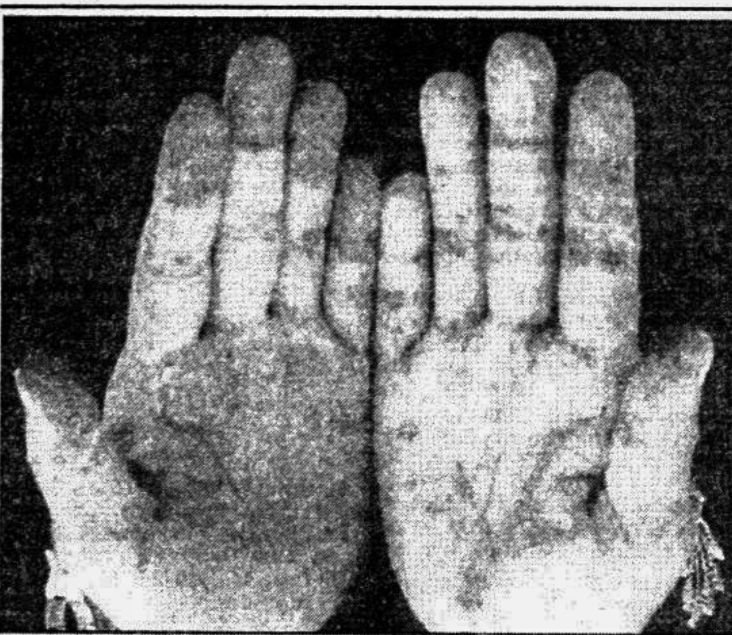
Affected hands of a man suffering from Arsenicosis.