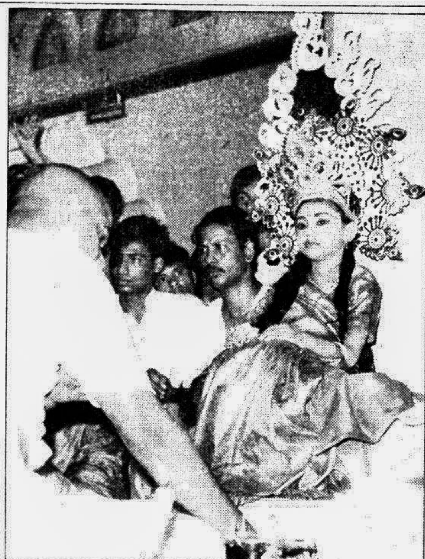
Hindu community performing Kumari Puja in the city yesterday.

"Domestic violence is routinely dismissed by law enforcement authorities as a private dispute and female victims who attempt to register a police complaint of spousal or familial physical abuse are invariably turned away," the US-based watchdog group said.