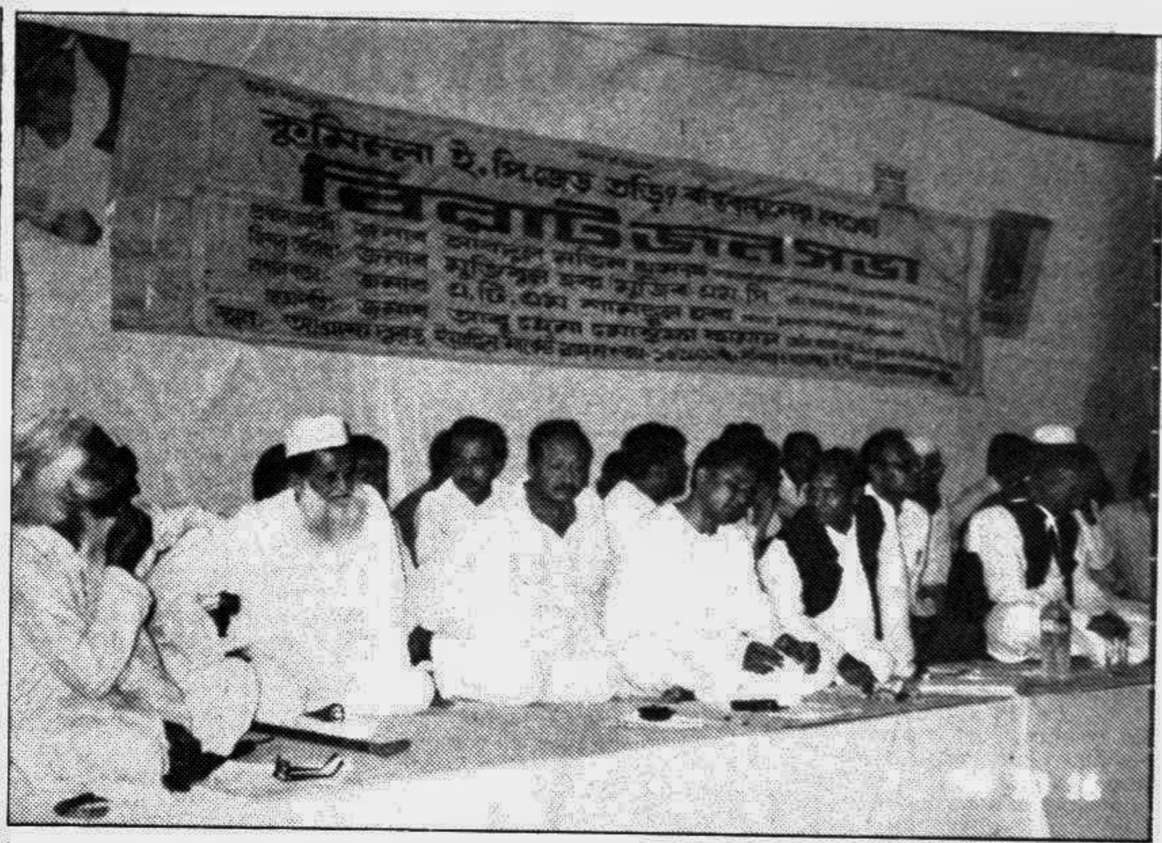
Minister for Law, Justice and Parliamentary Affairs Abdul Matin Khasru addressing as the chief guest at a public meeting arranged by Comilla EPZ Implementation Committee on Saturday at Comilla Old Airport. Abu Hena Mustafa Kamal presided over the meeting.

The boy was killed on the spot, while the woman died on way to hospital. The bodies were sent to hospital for autopsy. A case was filed.