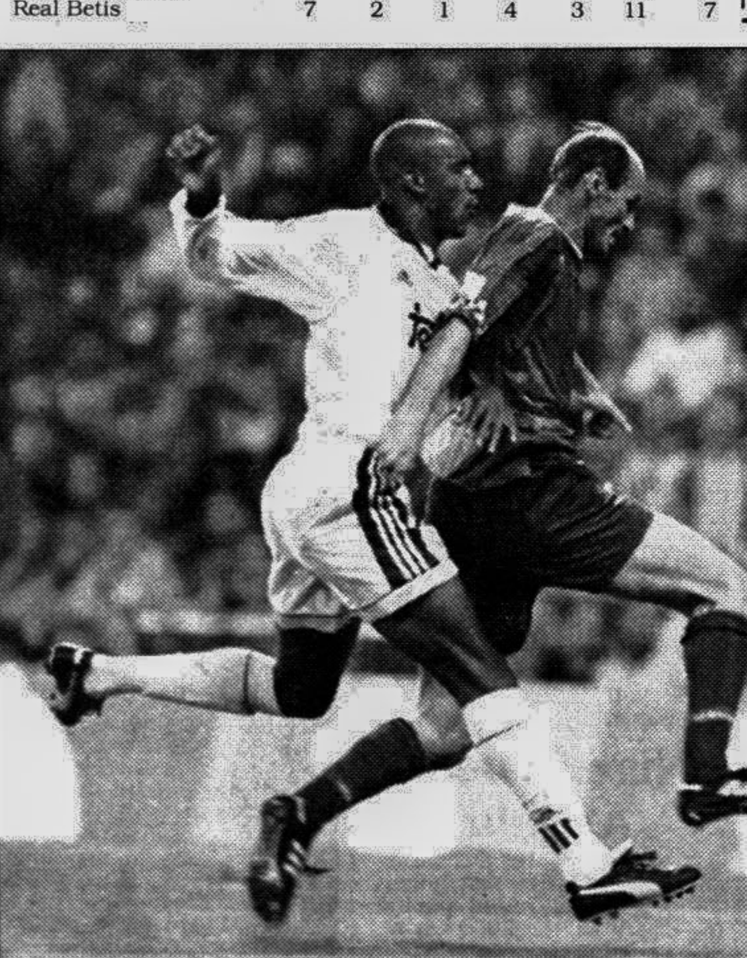
Oviedo's veteran Russian international Victor Onopko (R) keeping Real Madrid's Nicolas Anelka in check.