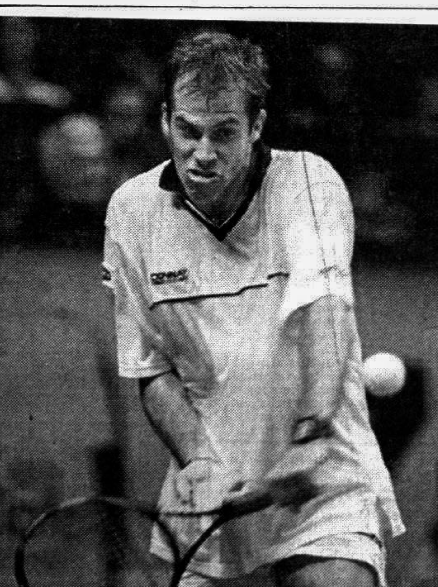
Briton Greg Rusedski playing backhand against Frenchman Sebastian Grosjean at the Austrian Indoor on October 15. Rusedski won 7-5, 6-2.

FUNCHAL, Madeira, Oct 16: An experimental world ranking system for athletes will be introduced before the start of the 2000 season, the International Amateur Athletic Federation (IAAF) said on Friday, reports Reuters. The IAAF said the intention was announced by president Primo Nebiolo at a news conference in the mid-Atlantic Portuguese island of Madeira. Nebiolo also gave details of the Golden League schedule for 2000 and said the Grand Prix final would be staged in Doha, Qatar, on October 4, just a few days after the Sydney Olympics which end on October 1. Nebiolo said the IAAF's Golden League series would start on June 30 with the second meeting scheduled for July 7. Those meetings would be in Rome and Paris, with a decision yet to be made on which date to attribute to which venue. Other dates were: July 28 — Oslo August 11 — Zurich August 18 — Monte Carlo August 25 — Brussels Sept 1 — Berlin Nebiolo said all the Golden League meetings would be held on Fridays to maximise television coverage.