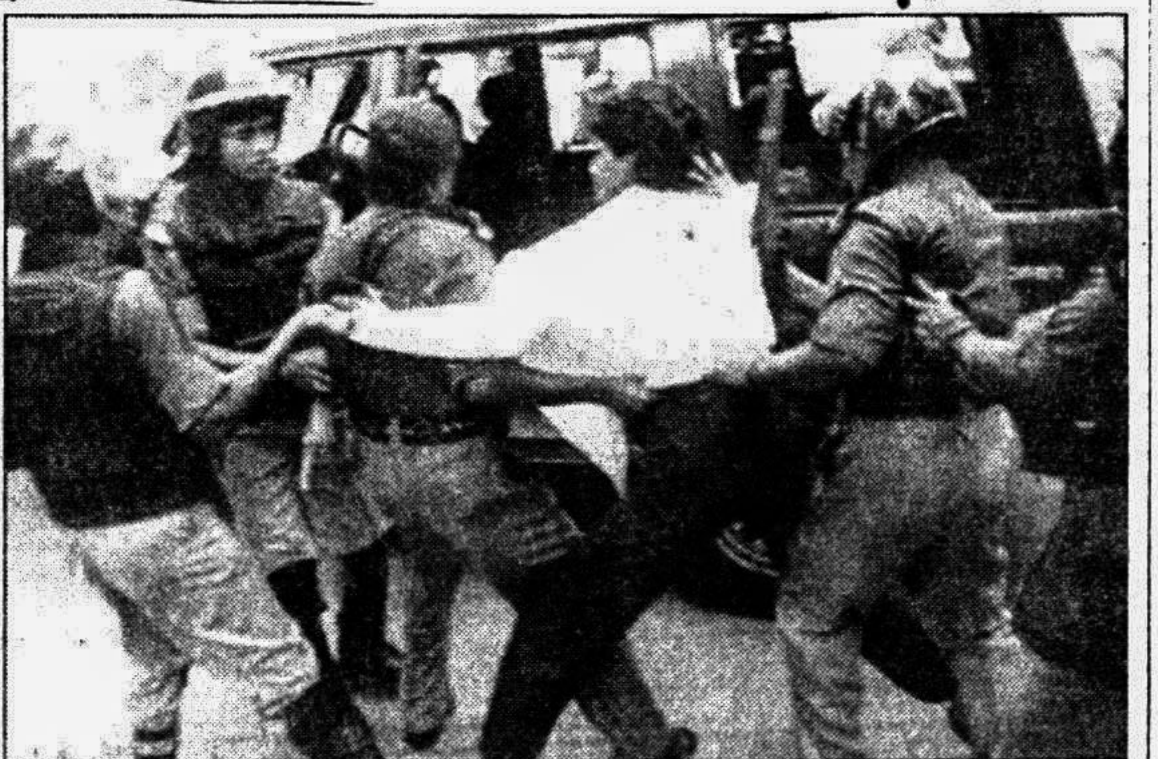
A pro-strike activist is being dragged to a police vehicle on Dhaka University campus yesterday.