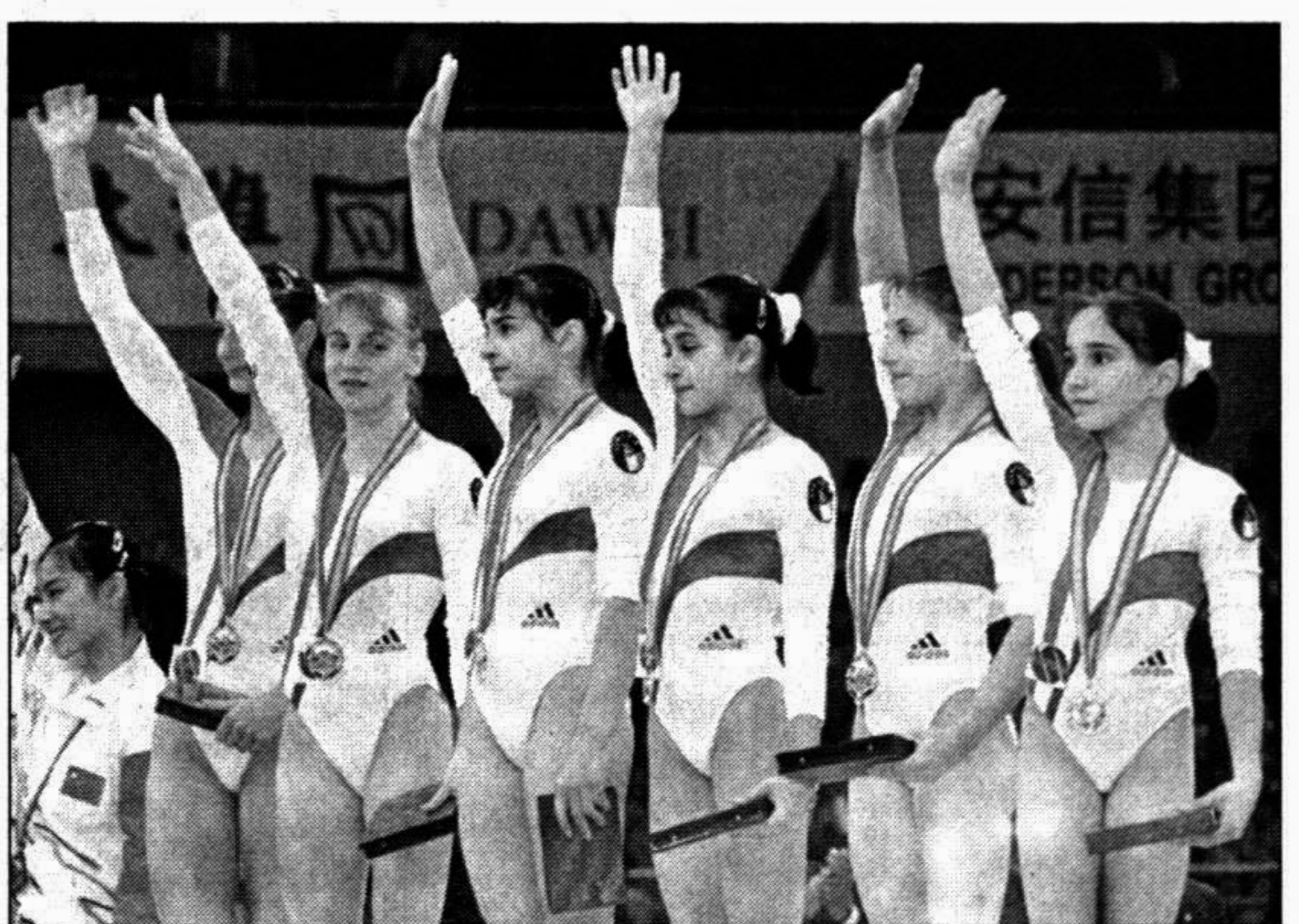
Romanian women team members wave to the crowd after receiving their gold medals yesterday.

The match, played at leisurely pace, ended 5-5 with AC Milan ex-international striker Maurizio Ganz scoring a hat-trick for the Italian team and Ronaldo on target for the Inter side.