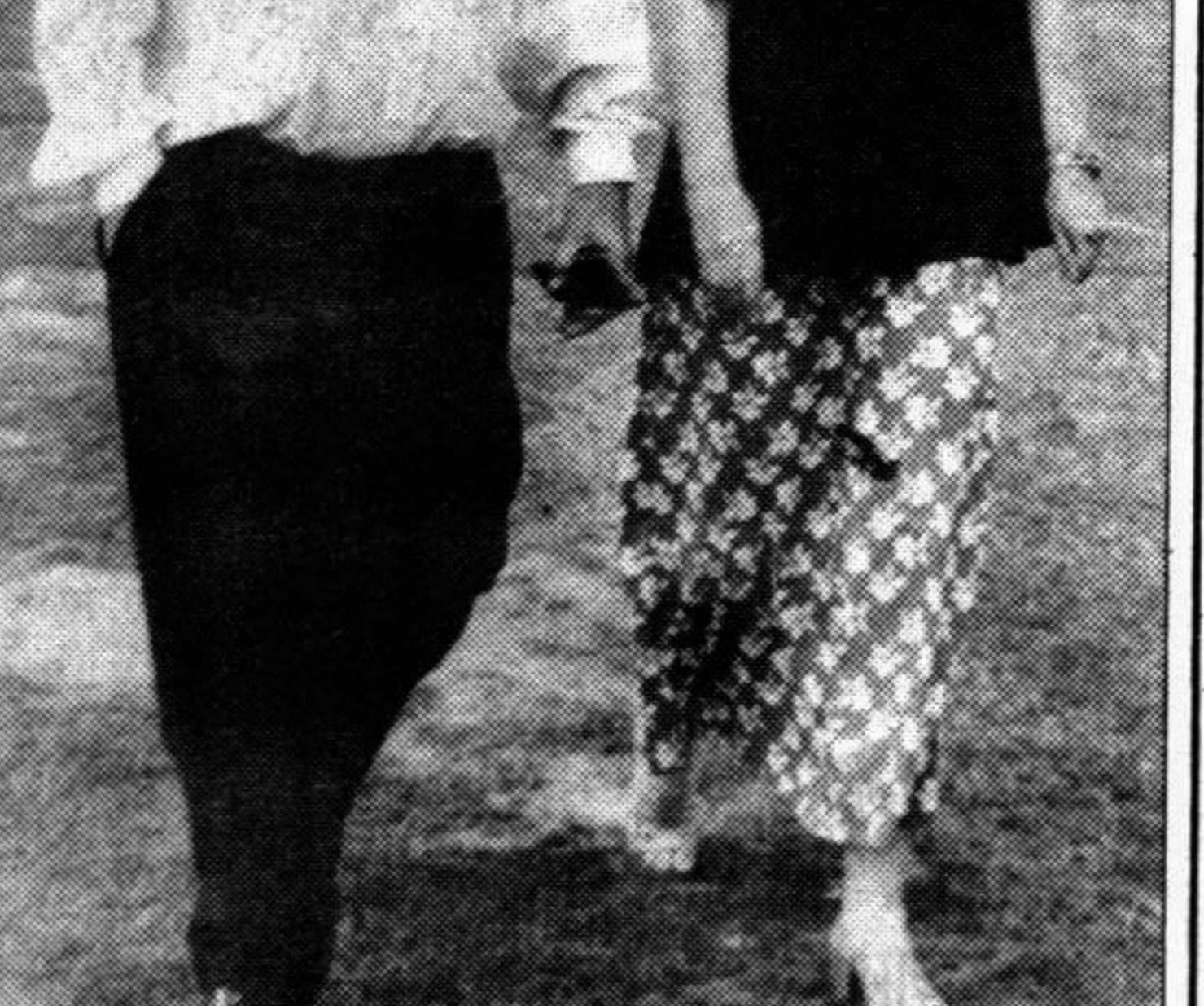
Bangladesh cricket coach Eddie Barlow and his wife visiting the Bangabandhu National Stadium yesterday.

WARSAW, Oct 12: The hoodlum who injured Parma's Dino Baggio with a thrown knife in a UEFA Cup game late last year is to be formally charged, Polish prosecutors said here on Monday, reports AFP.