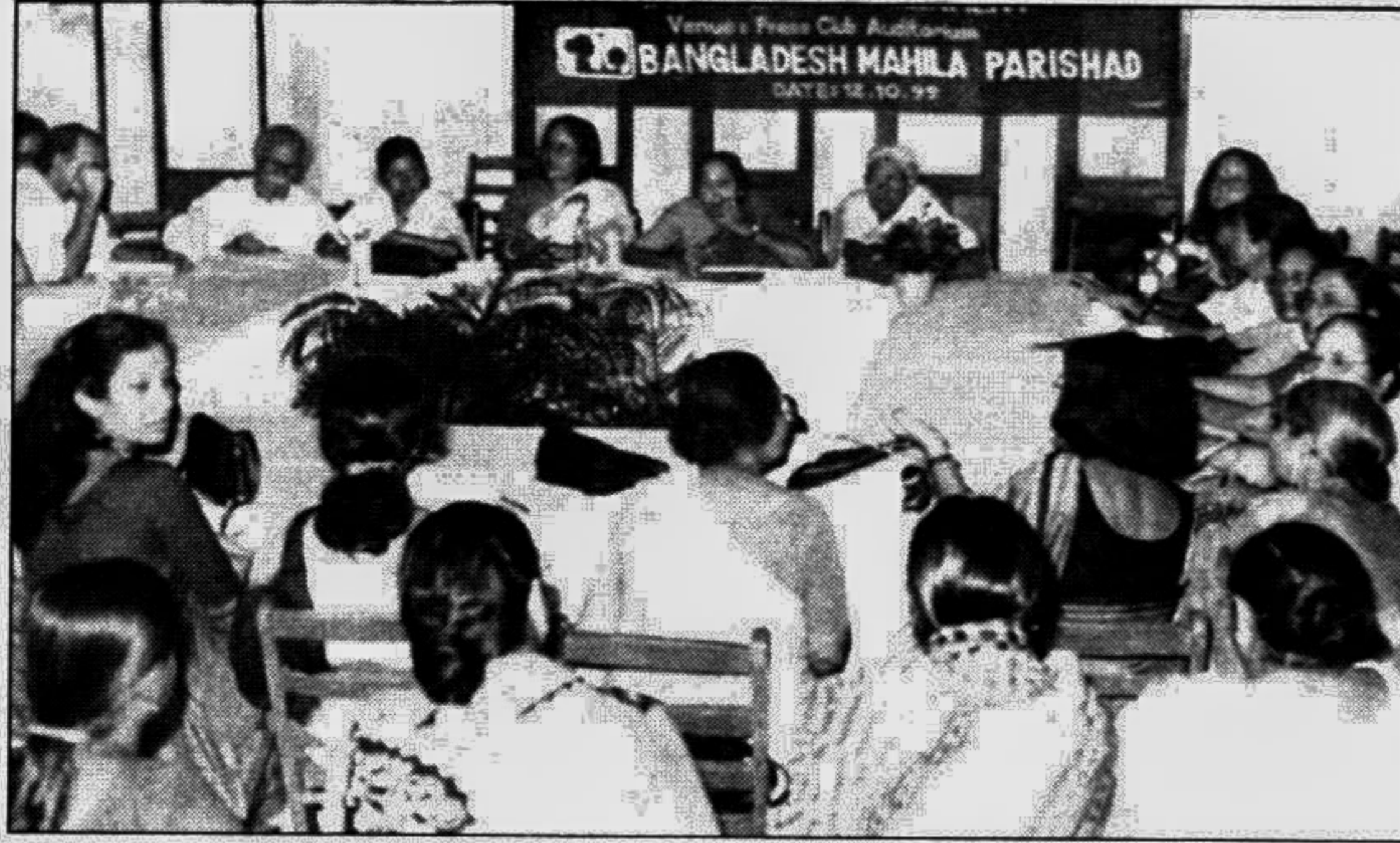
Different women's organisations held a roundtable meeting at the Jatiya Press Club yesterday to demand increase in the number of reserved seats for women in the Jatiya Sangsad.

He was also associated with many socio-cultural organisations and was a true exponent of Bengali nationalism.