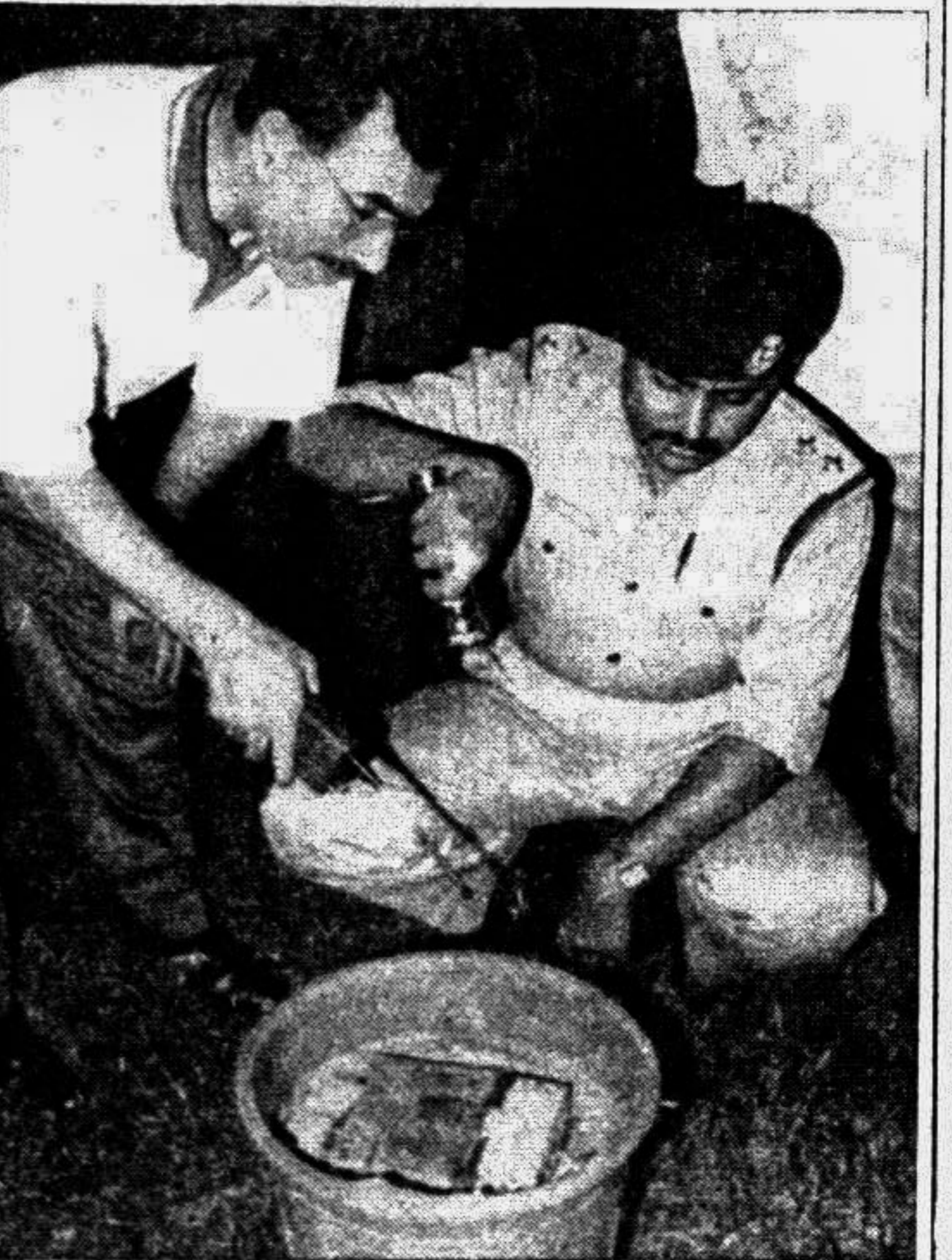
Policemen take a look at the "bomb" they removed from a 12-storey residential building in the city yesterday.