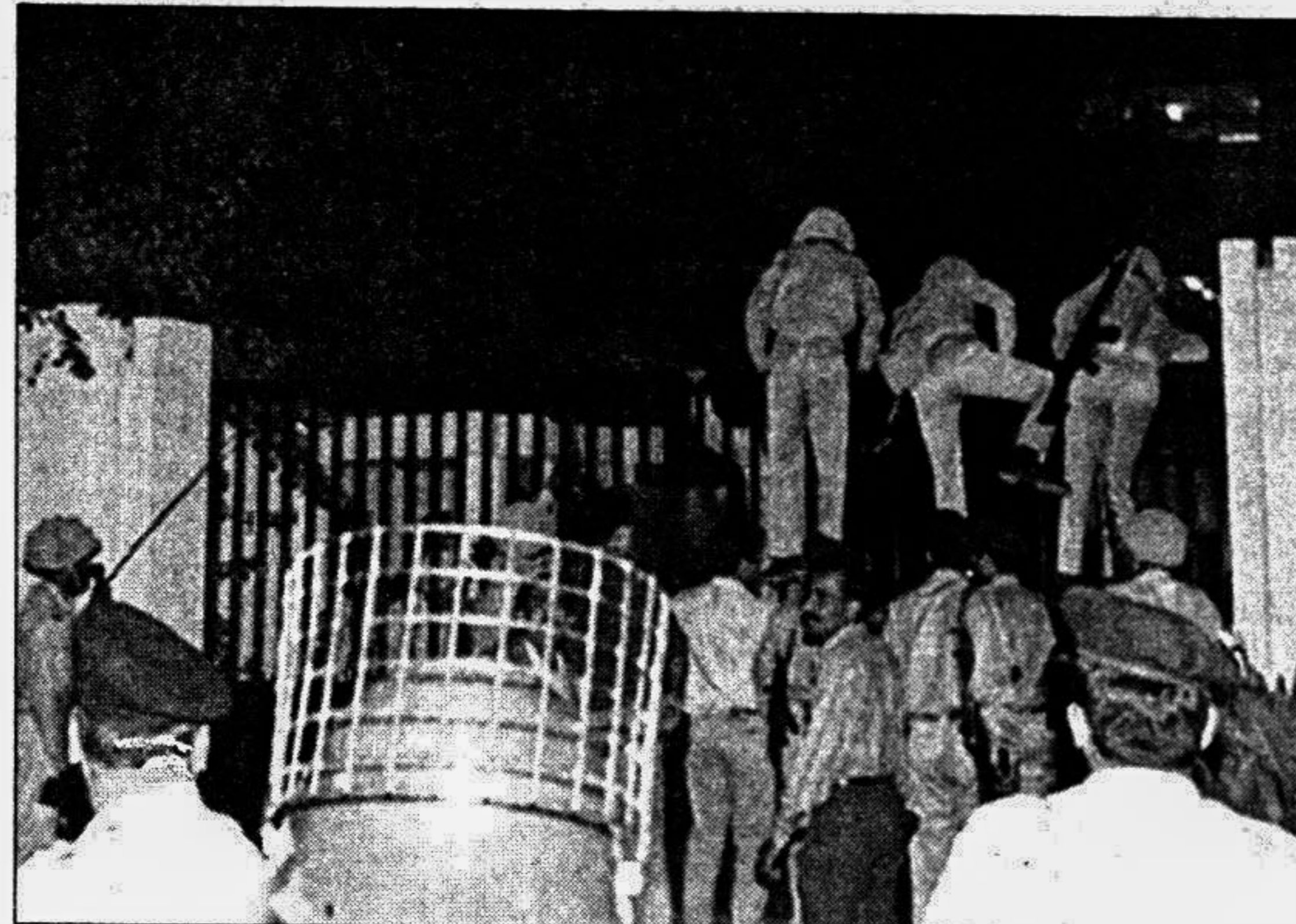
Soldiers enter the Pakistan state television building by jumping over the gate in Islamabad following the dismissal of Army Chief General Pervez Musharraf yesterday.