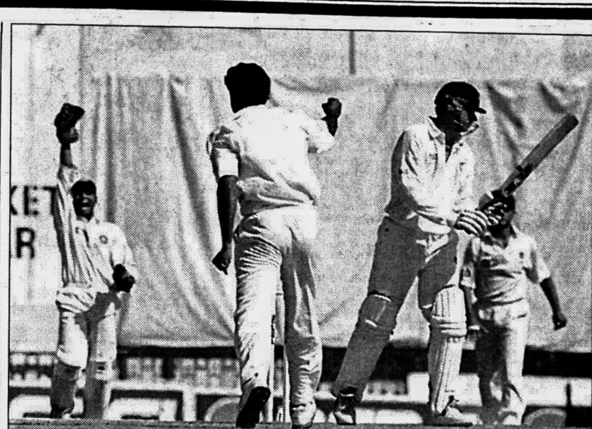
Indian fast bowler Javagal Srinath is jubilant after trapping New Zealand skipper Stephen Fleming leg before on the second day of the first Test at Mohali yesterday.

The idea of raising funds for fighting the dreaded disease struck Botham 15 years ago when he had gone to a London hospital for a minor operation.