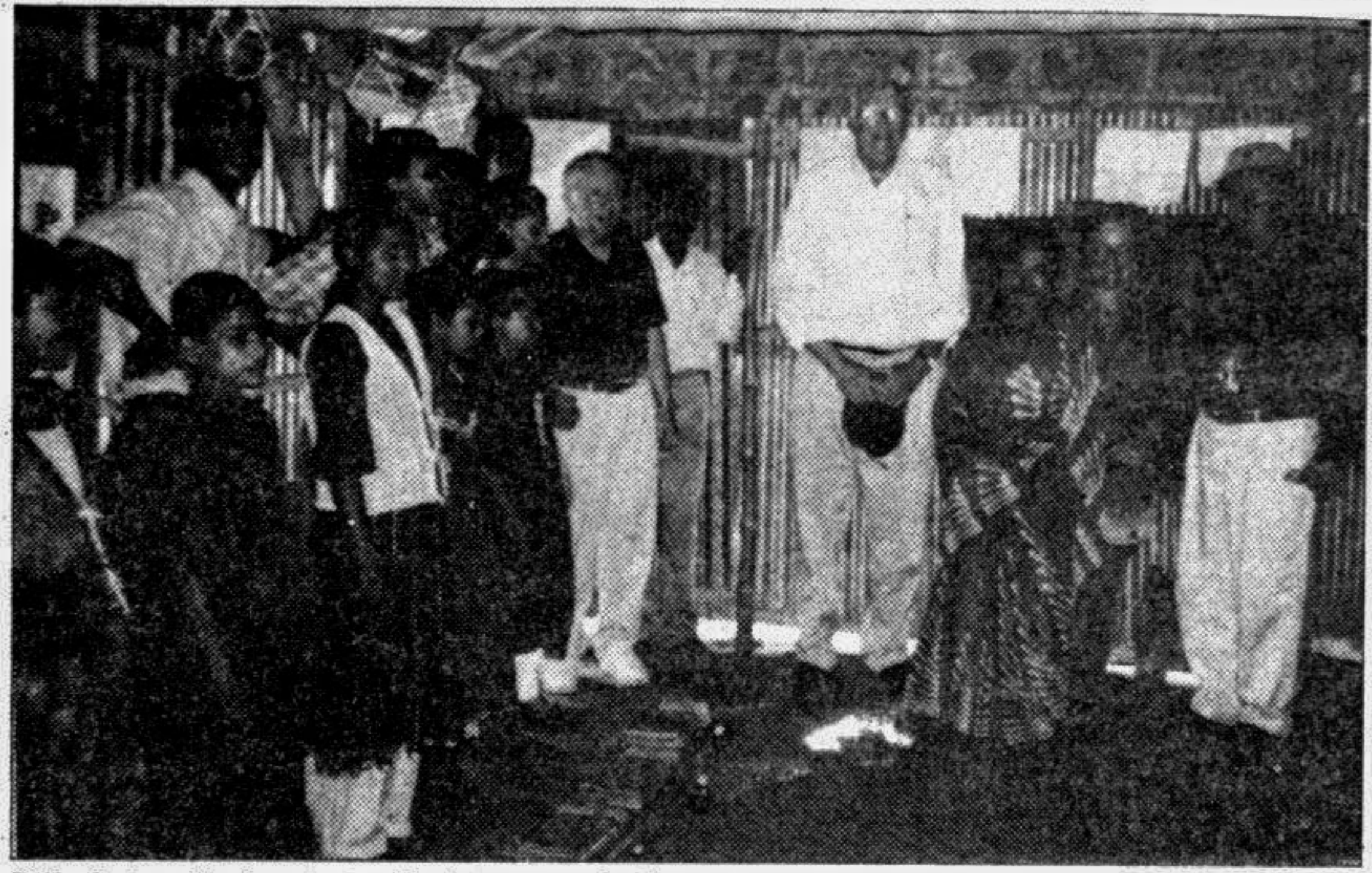
Bill Gates Sr (centre), Chairman and Chief Executive of "Bill and Melinda Gates Foundation" visiting a BRAC school at village Mobarakdi under Matlab thana in Chandpur district on Friday. The foundation supports philanthropic institutions in the areas of global health and learning. He is seen flanked by teachers and some students of the school.

BARISAL, Oct 11: Bangladesh Krishi Bank (BKB) realised outstanding loan amounting to Taka 19.13 crore from its borrowers in 11 southern districts under Barisal Agriculture zone between July 1 and September 15, reports BSS. The district are Barisal, Jhalakathi, Bhola, Pirojpur, Patuakhali, Barguna, Fariapur, Gopalganj, Madaripur, Rajbari and Shariatpur. A BKB source said the target of realisation of outstanding loan in these districts has been fixed at Taka 165 crore in the current fiscal year. The district-wise break-up of arrears are: Barisal Taka 18 crore, Jhalakathi Taka 6.40 crore, Pirojpur Taka 10.40 crore, Bhola Taka 1.8 crore, Patuakhali Taka 20 crore, Barguna Taka 15.40 crore, Fariapur Taka 20.70 crore, Madaripur Taka 17.50 crore, Rajbari Taka 13.00 crore, Gopalganj Taka 13.50 crore and Shariatpur Taka 12 crore.