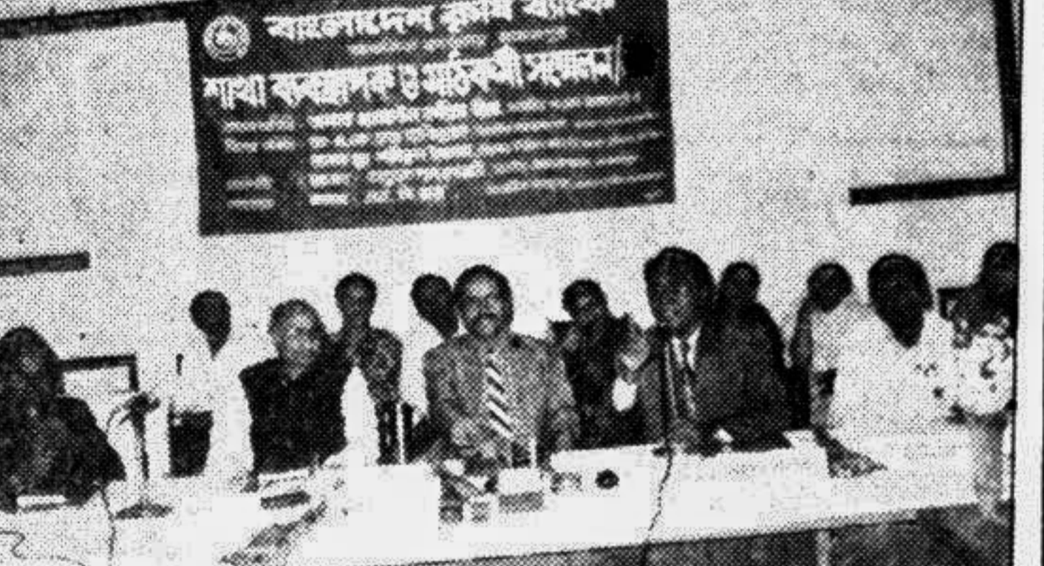
Rezaul Karim, local MP of Jamalpur speaking recently as the chief guest at the conference of Bangladesh Krishi Bank staffers at its regional office in Jamalpur.