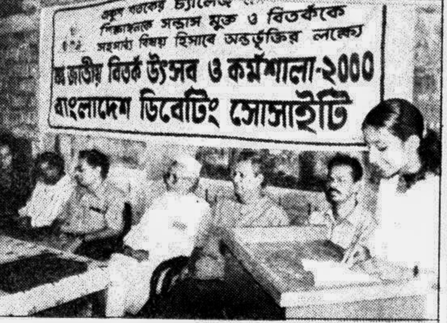
Bangladesh Debating Society arranged recently a debate competition at Sylhet Sirajuddin Academy. Photo shows a student taking part in the competition.