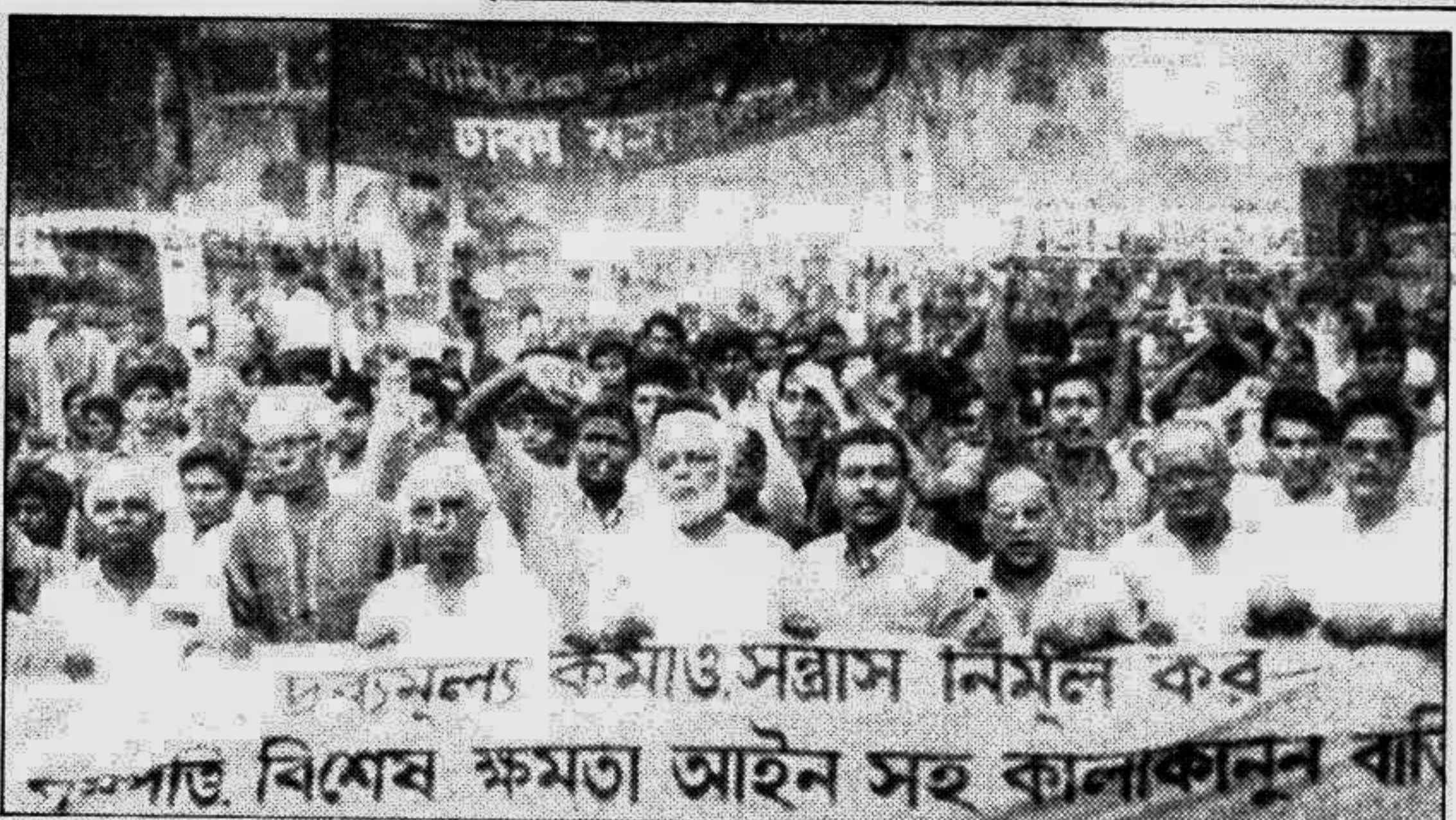
Gano Forum (GF) brought out a procession in the city yesterday protesting price-hike of essentials and demanding repeal of Special Powers Act.