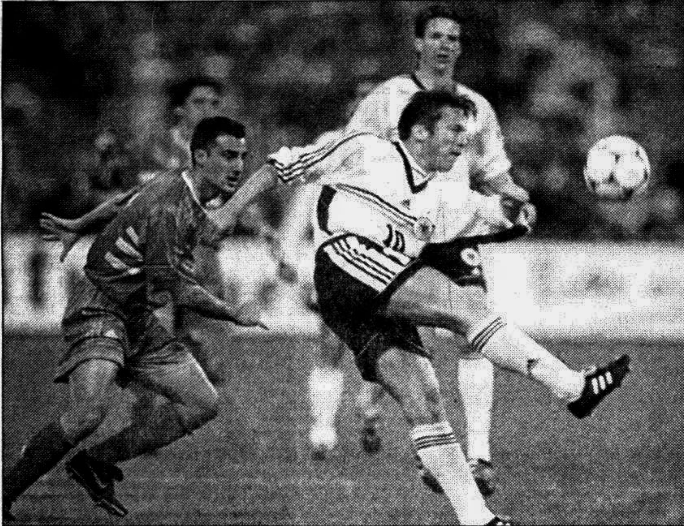
Germany's Lothar Matthaeus tries to control the ball ahead of a Turkish player.

In keeping with the AFC's profile, a major sports medicine seminar would be held here in May 24-27, 2000, he said.